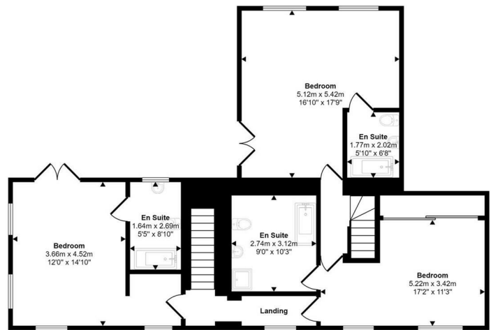
First Floor Approx 97 sq m / 1046 sq ft

This floorplan is only for illustrative purposes and is not to scale. Measurements of rooms, doors, windows, and any items are approximate and no responsibility is taken for any error, omission or mis-statement. Icons of items such as bathroom suites are representations only and may not look like the real items. Made with Made Snappy 360.