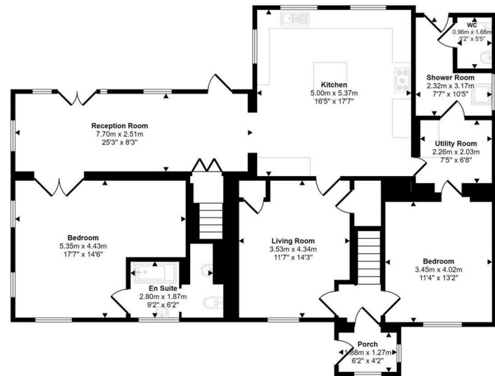
Ground Floor Approx 136 sq m / 1466 sq ft

This floorplan is only for illustrative purposes and is not to scale. Measurements of rooms, doors, windows, and any items are approximate and no responsibility is taken for any error, omission or mis-statement. Icons of items such as bathroom suites are representations only and may not look like the real items. Made with Made Snappy 360.