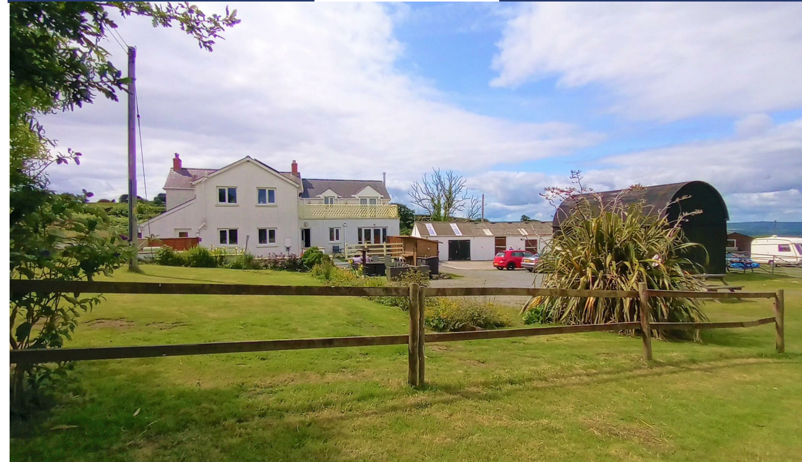
Pantysgyfarnog Llangynog, Carmarthen, SA33 5DE

WE WOULD LIKE TO POINT OUT THAT OUR PHOTOGRAPHS ARE TAKEN WITH A DIGITAL CAMERA WITH A WIDE ANGLE LENS. These particulars have been prepared in all good faith to give a fair overall view of the property. If there is any point which is of specific importance to you, please check with us first, particularly if travelling some distance to view the property. We would like to point out that the following items are excluded from the sale of the property: Fitted carpets, curtains and blinds, curtain rods and poles, light fittings, sheds, greenhouses - unless specifically specified in the sales particulars. Nothing in these particulars shall be deemed to be a statement that the property is in good structural condition or otherwise. Services, appliances and equipment referred to in the sales details have not been tested, and no warranty can therefore be given. Purchasers should satisfy themselves on such matters prior to purchase. Any areas, measurements or distances are given as a guide only and are not precise. Room sizes should not be relied upon for carpets and furnishings.