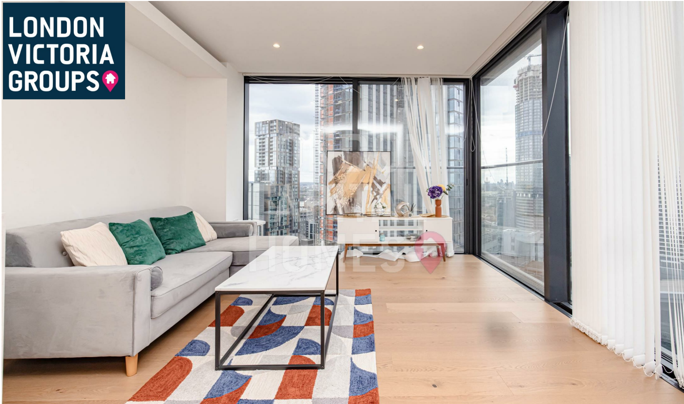
Hampton Tower, 75 Marsh Wall , London E14 9RA