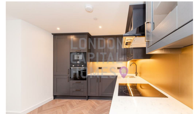
3 Merino Gardens , LONDON E1W 2DP