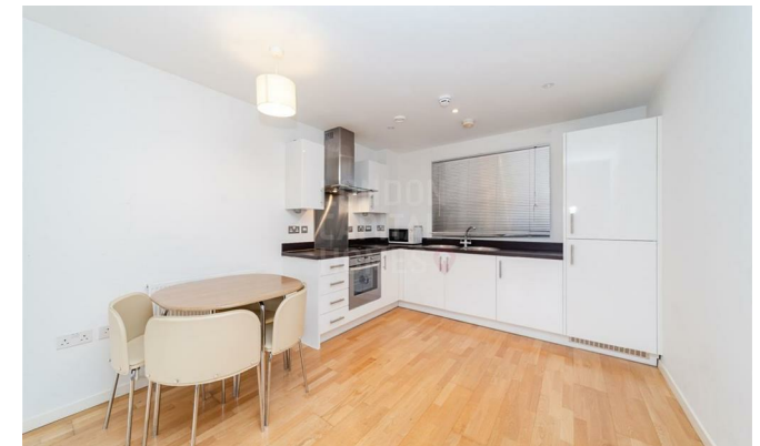
Bolanachi Building, Spa Road , London SE16 3SG