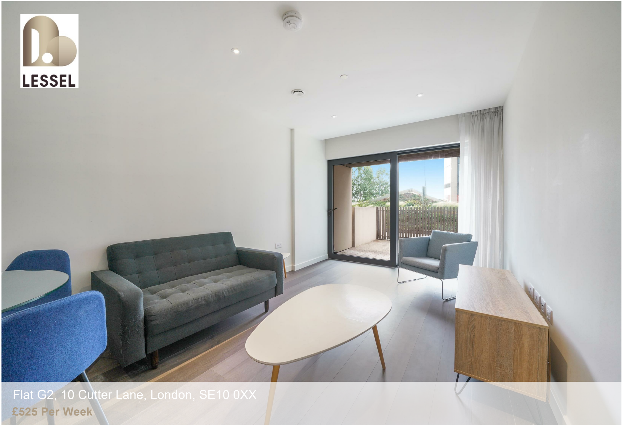
Flat G2, 10 Cutter Lane, London, SE10 0XX £525 Per Week