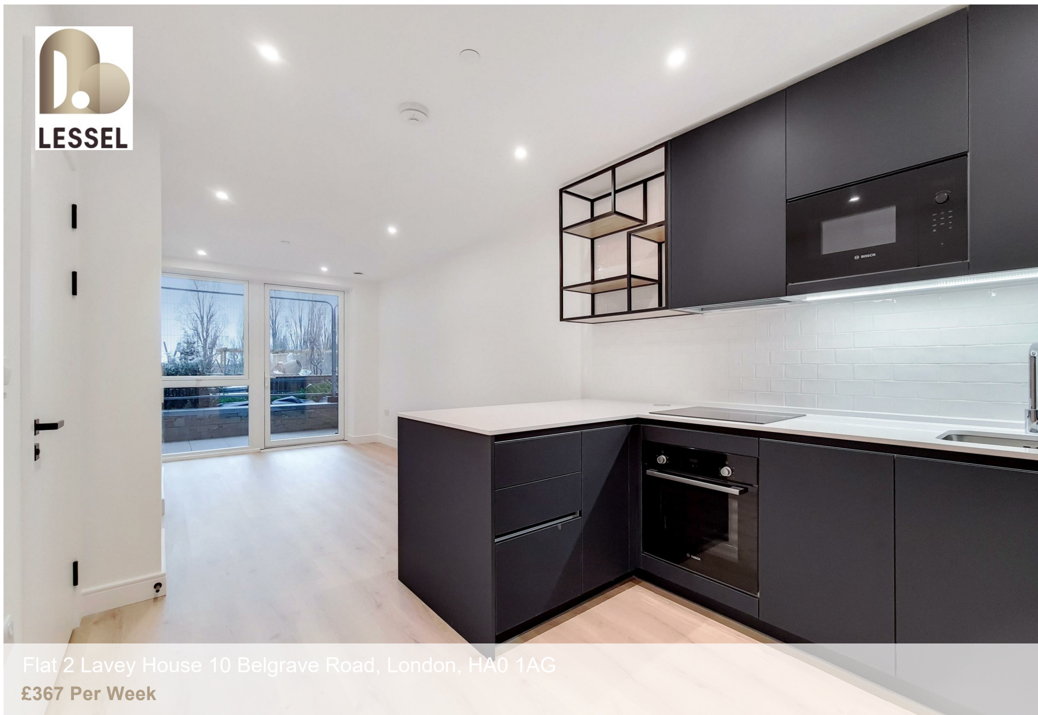
Flat 2 Lavey House 10 Belgrave Road, London, HA0 1AG £367 Per Week