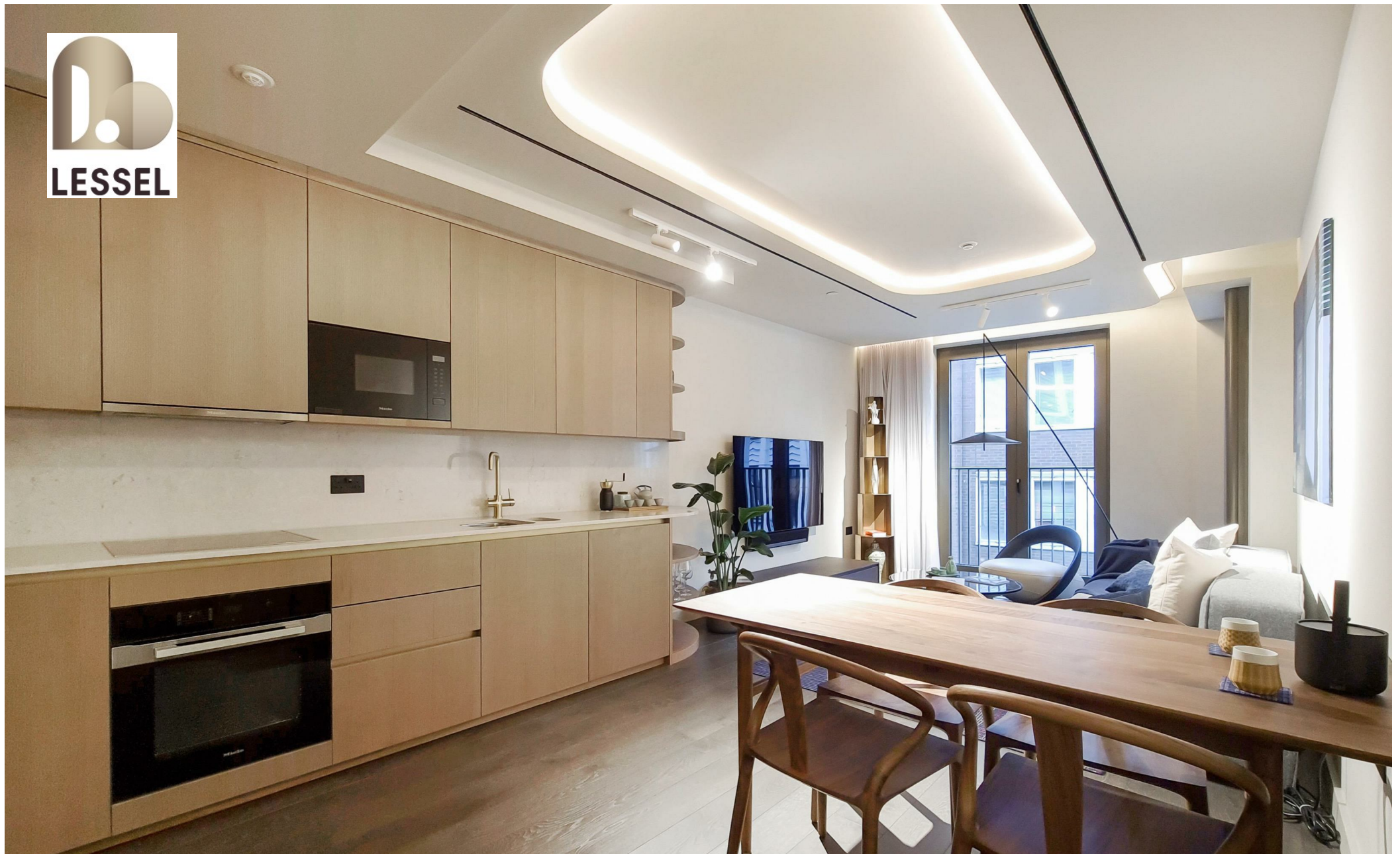
Apartment 107C 1 Fareham Street, London, W1F 8BB £1,570,000