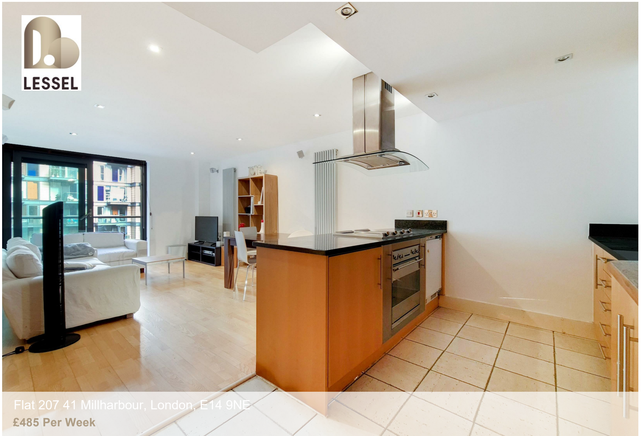
Flat 207 41 Millharbour, London, E14 9NE £485 Per Week