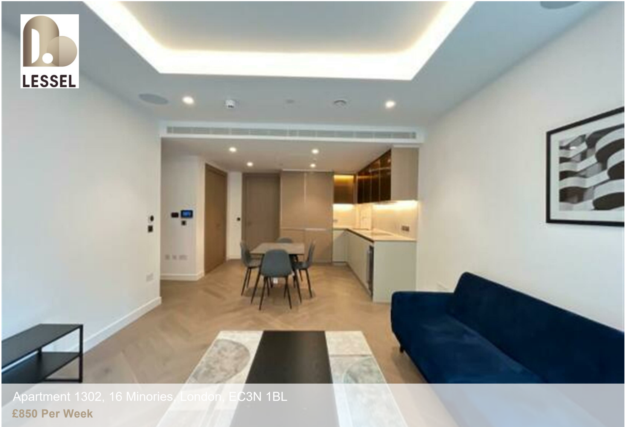
Apartment 1302, 16 Minories, London, EC3N 1BL £850 Per Week