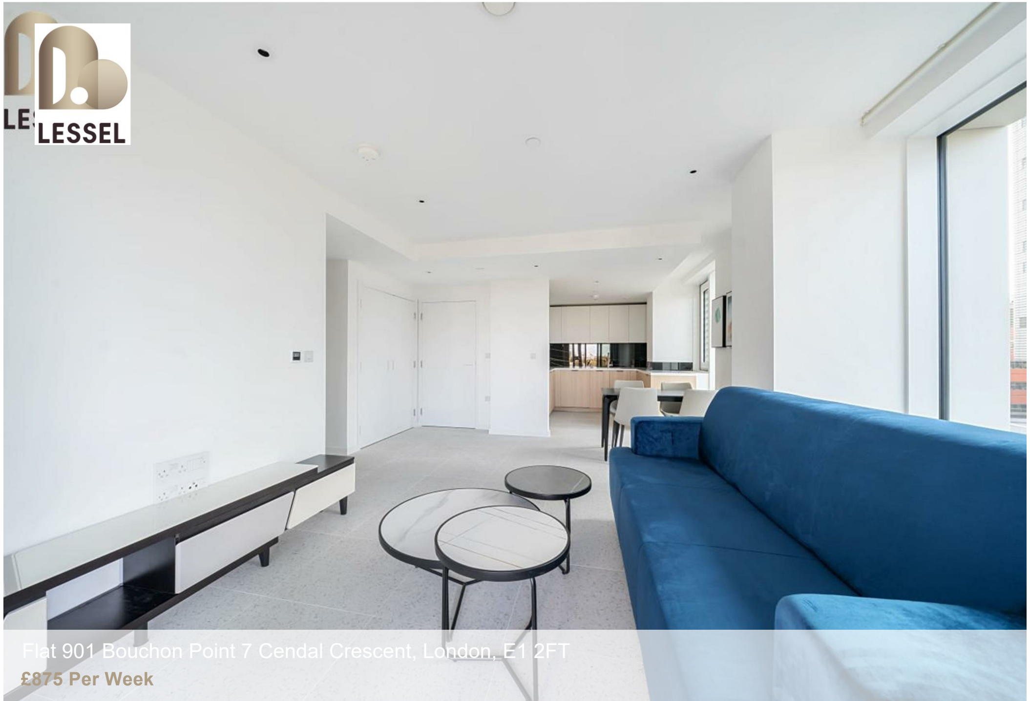
Flat 901 Bouchon Point 7 Cendal Crescent, London, E1 2FT £875 Per Week