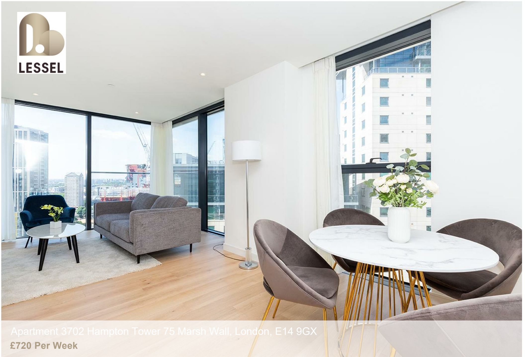
Apartment 3702 Hampton Tower 75 Marsh Wall, London, E14 9GX £720 Per Week