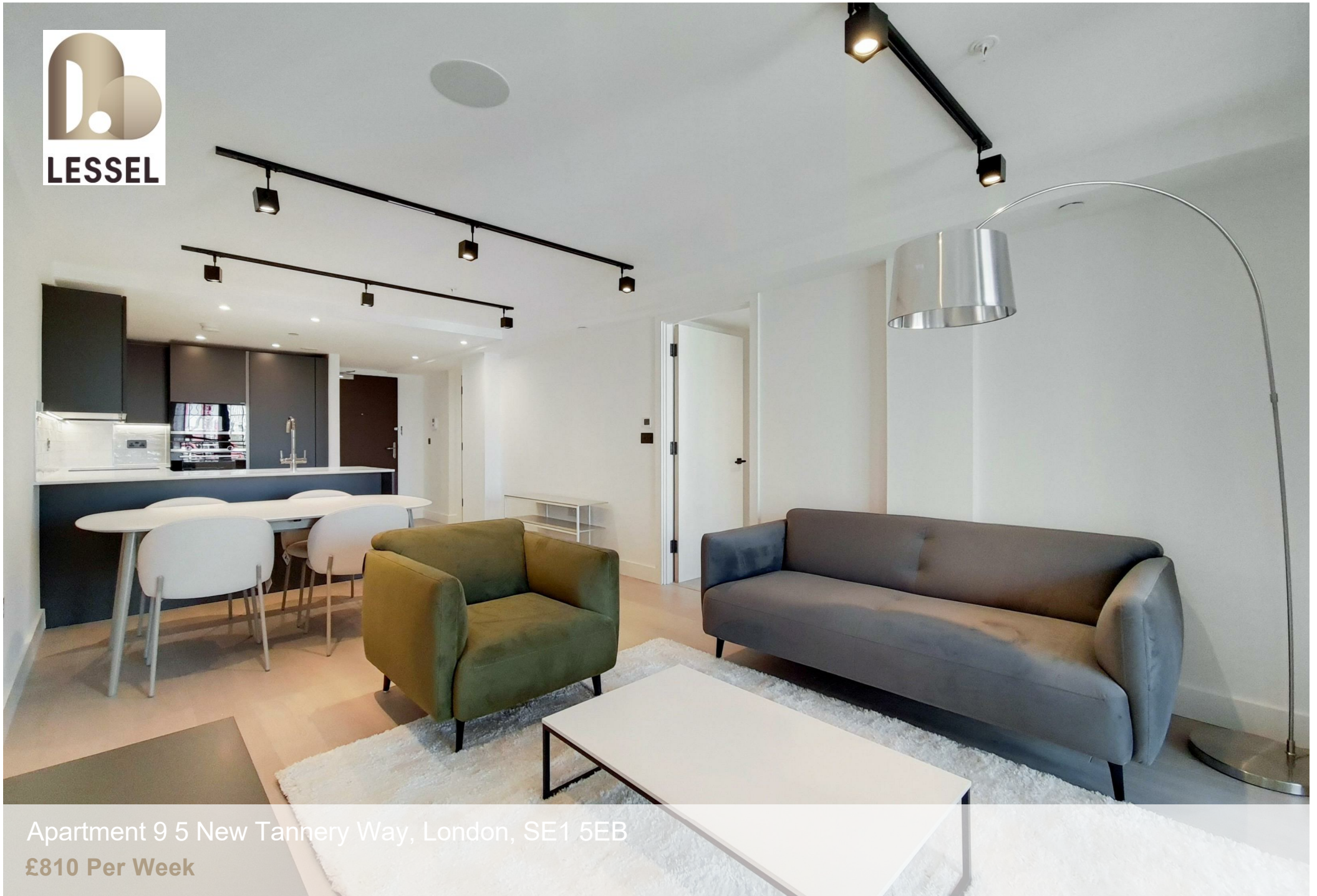
Apartment 9 5 New Tannery Way, London, SE1 5EB £810 Per Week