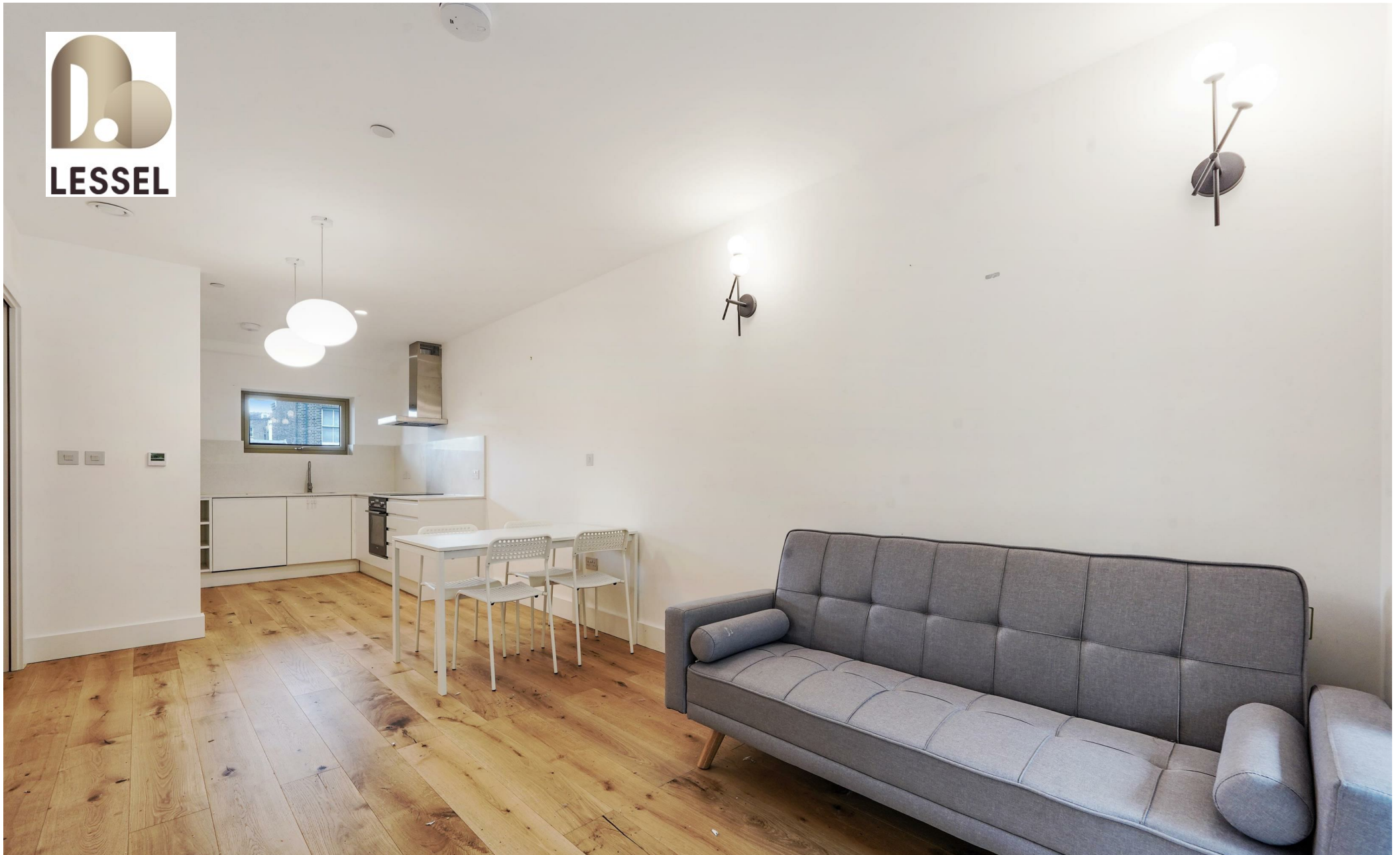
12 Sidings Apartments East Churchfield Road, Acton, W3 7QF £460 Per Week