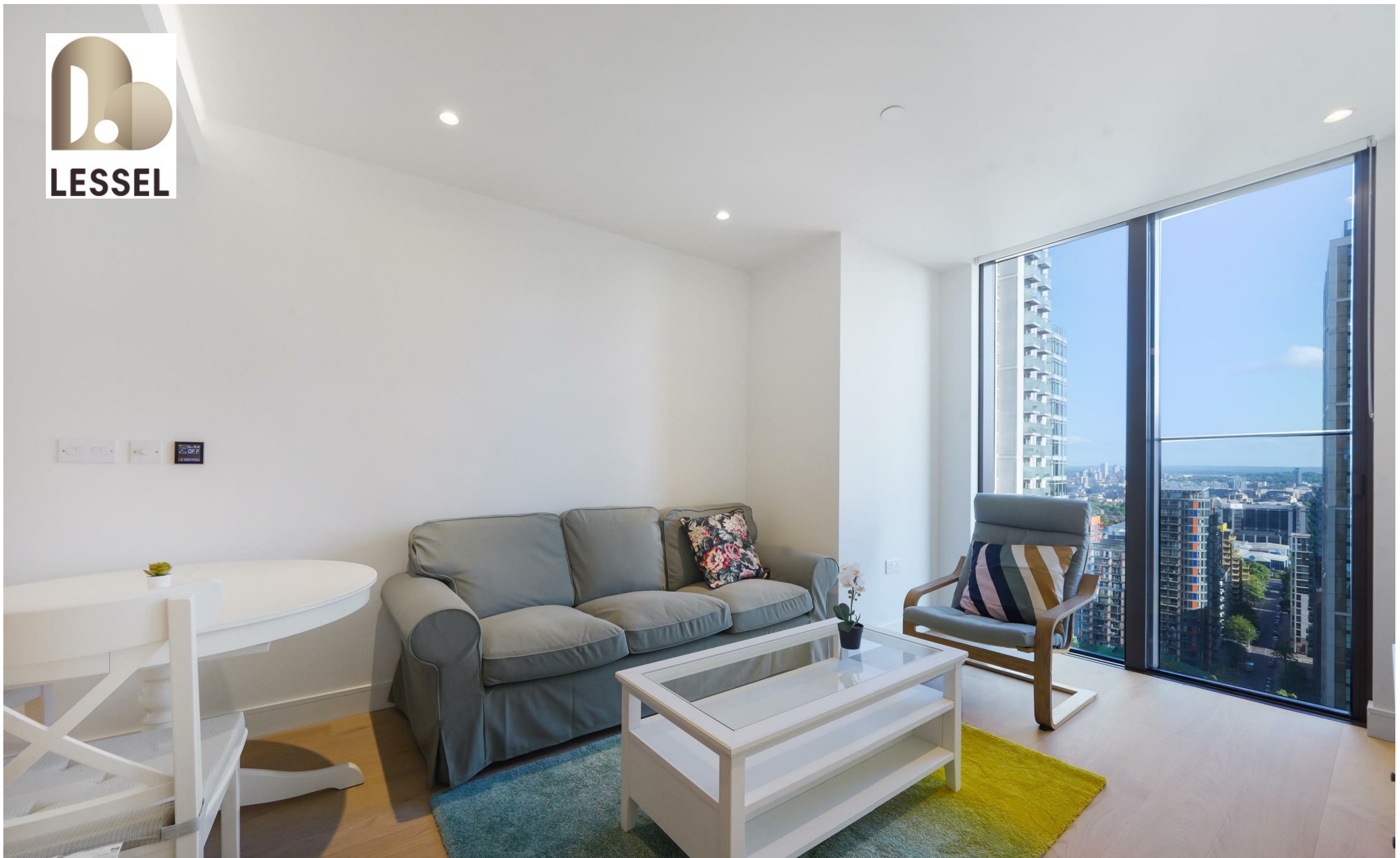
Flat 2009 Harcourt Tower 67 Marsh Wall, London, E14 9GS £807 Per Week