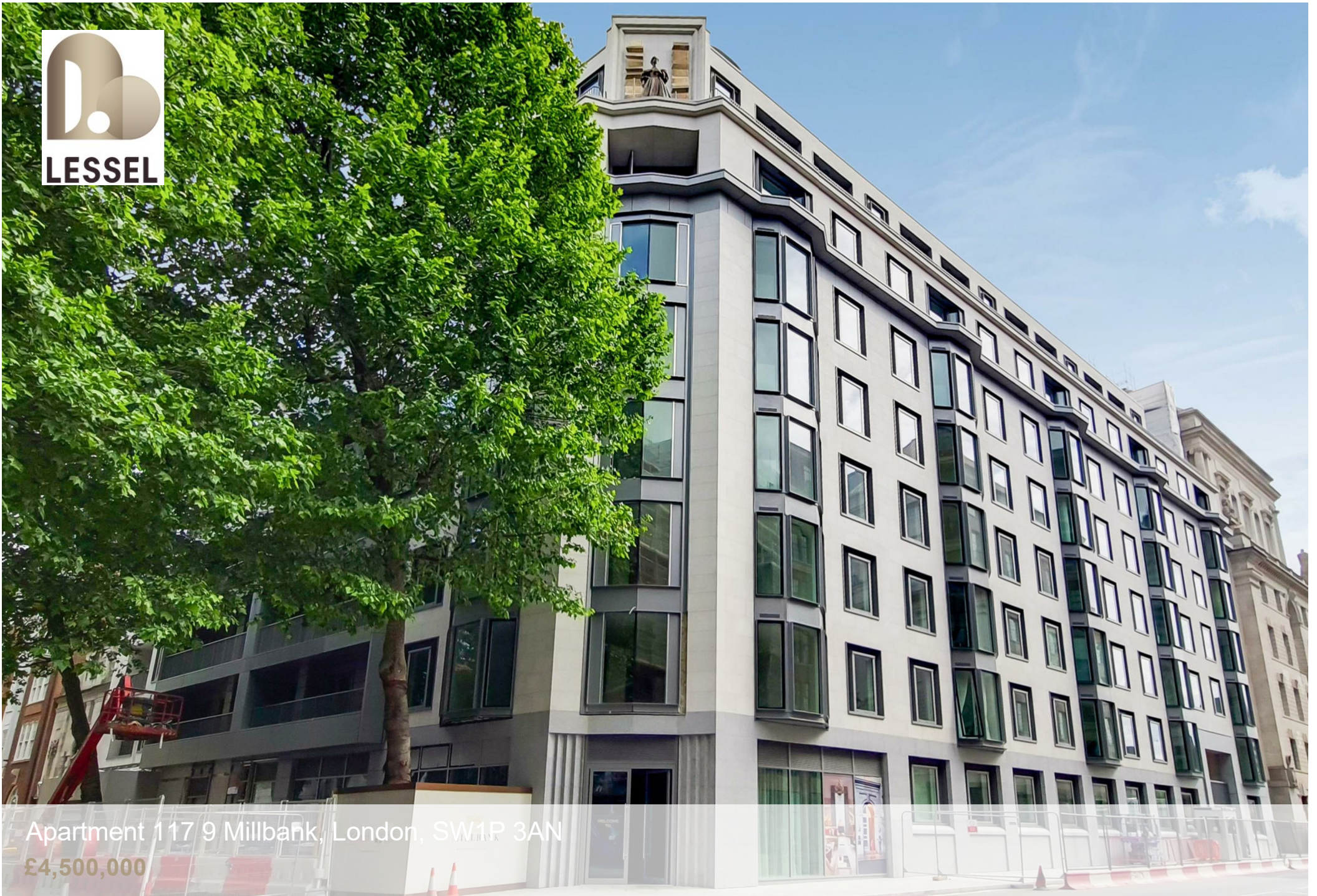
Apartment 117 9 Millbank, London, SW1P 3AN £4,500,000