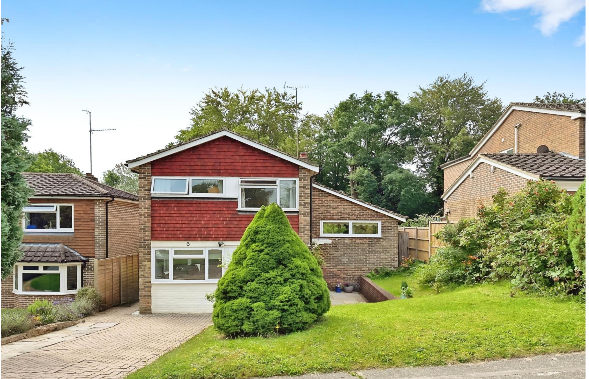
Forestfield, Horsham, West Sussex, RH13 6DZ. Guide Price £650,000 Freehold