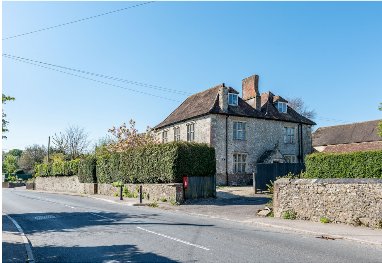
The Old Manor House is situated in the heart of the village of Maiden Bradley and surrounded by an enclosed garden with a mature copper beech, apple and pear trees.