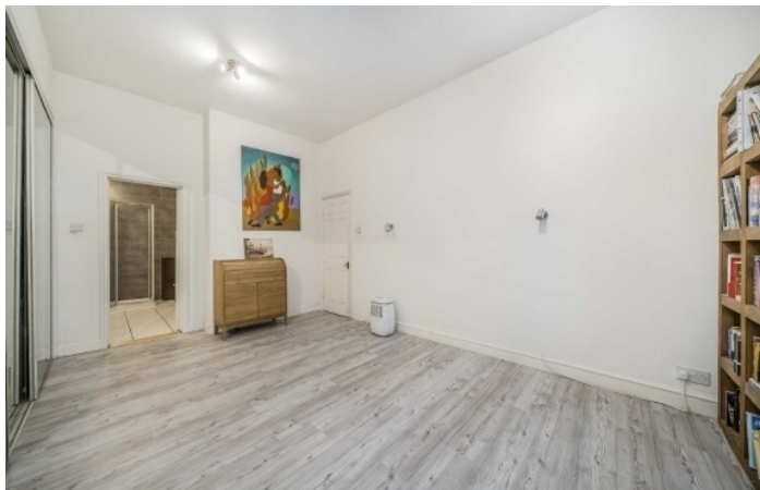
The Highway, E1W