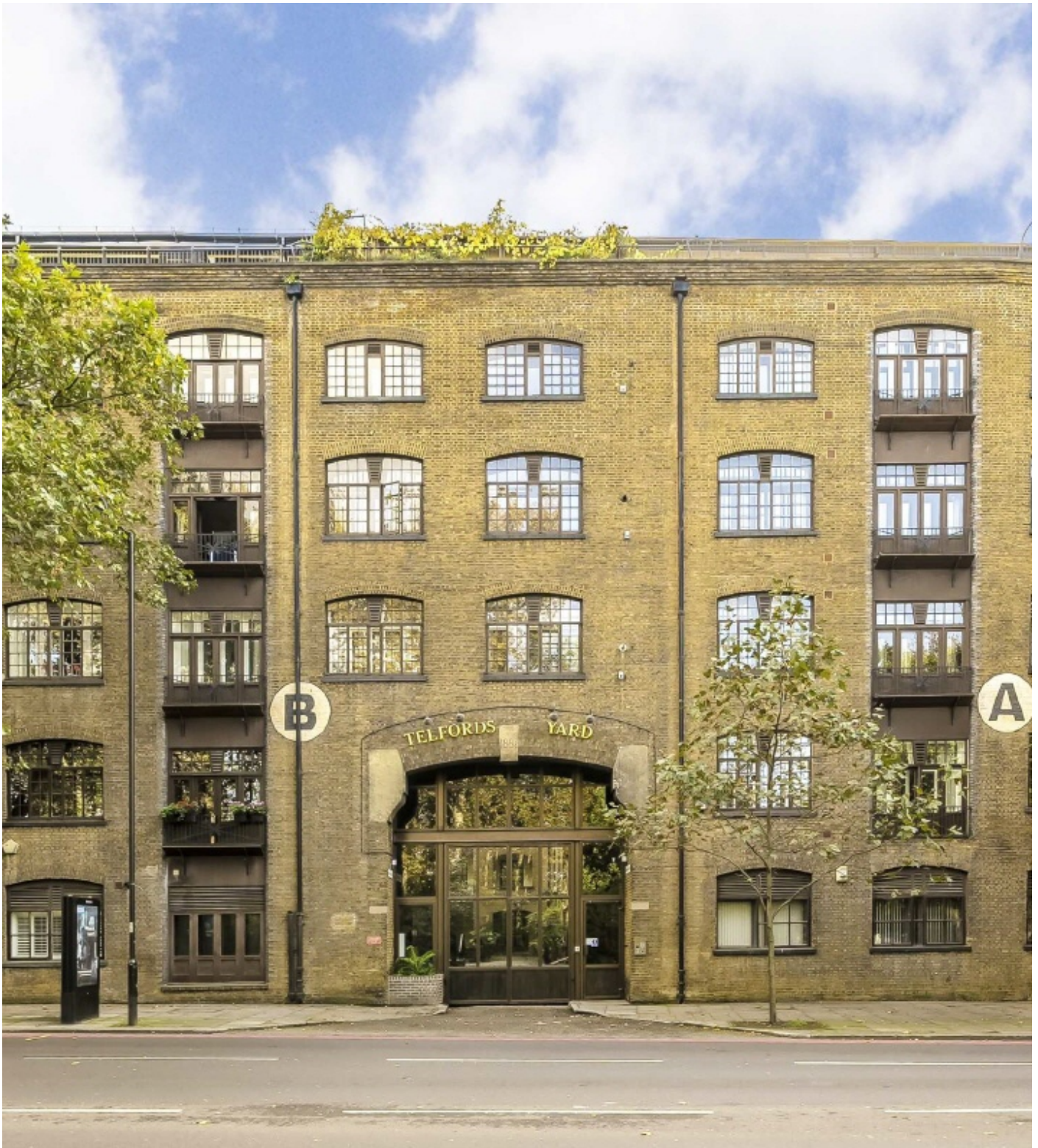
Telfords Yard, E1W £2,100,000