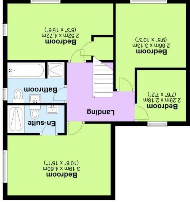
First Floor Approx. 56.9 sq. metres (612.5 sq. feet)