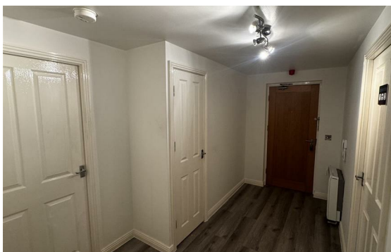
Modern Two-Bedroom First Floor Apartment in Pentwyn

Situated in a quiet cul-de-sac in the popular area of Pentwyn, this Newly fully refurbished first-floor apartment offers contemporary living in a convenient location. Boasting two generously sized double bedrooms, the property is ideal for a professional couple seeking a stylish and low-maintenance home.