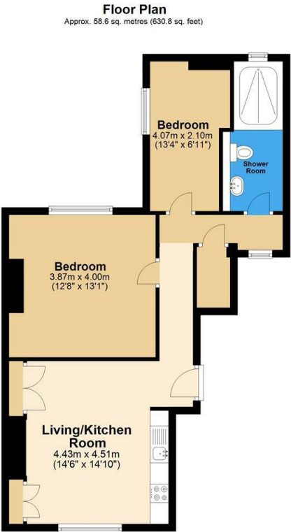
Total area: approx. 58.6 sq. metres (630.8 sq. feet)