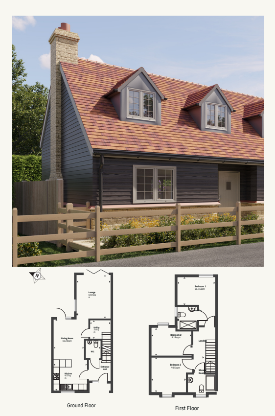
98.26sqm - 1058sqft