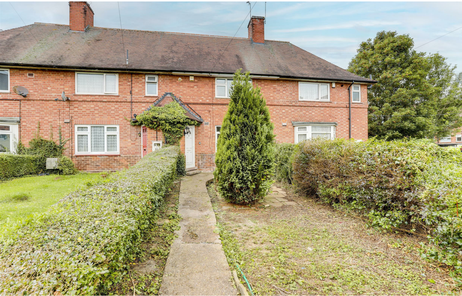
Winsford Close, Aspley, Nottinghamshire NG8 5JR