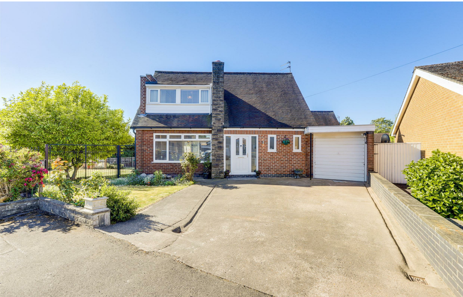
St. Margarets Avenue, Aspley, Nottinghamshire NG8 5GD