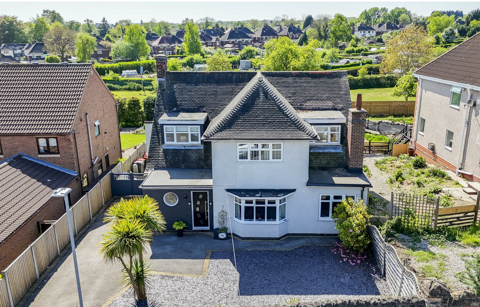
Sandy Lane, Hucknall, Nottinghamshire NG15 7GP