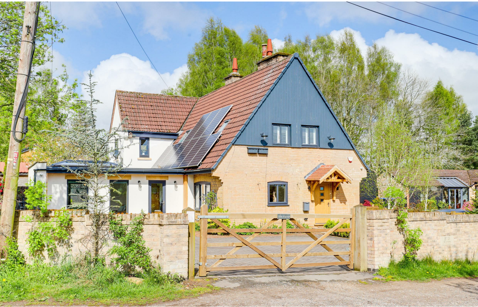
Whyburn Lane, Hucknall, Nottinghamshire NG15 6QP