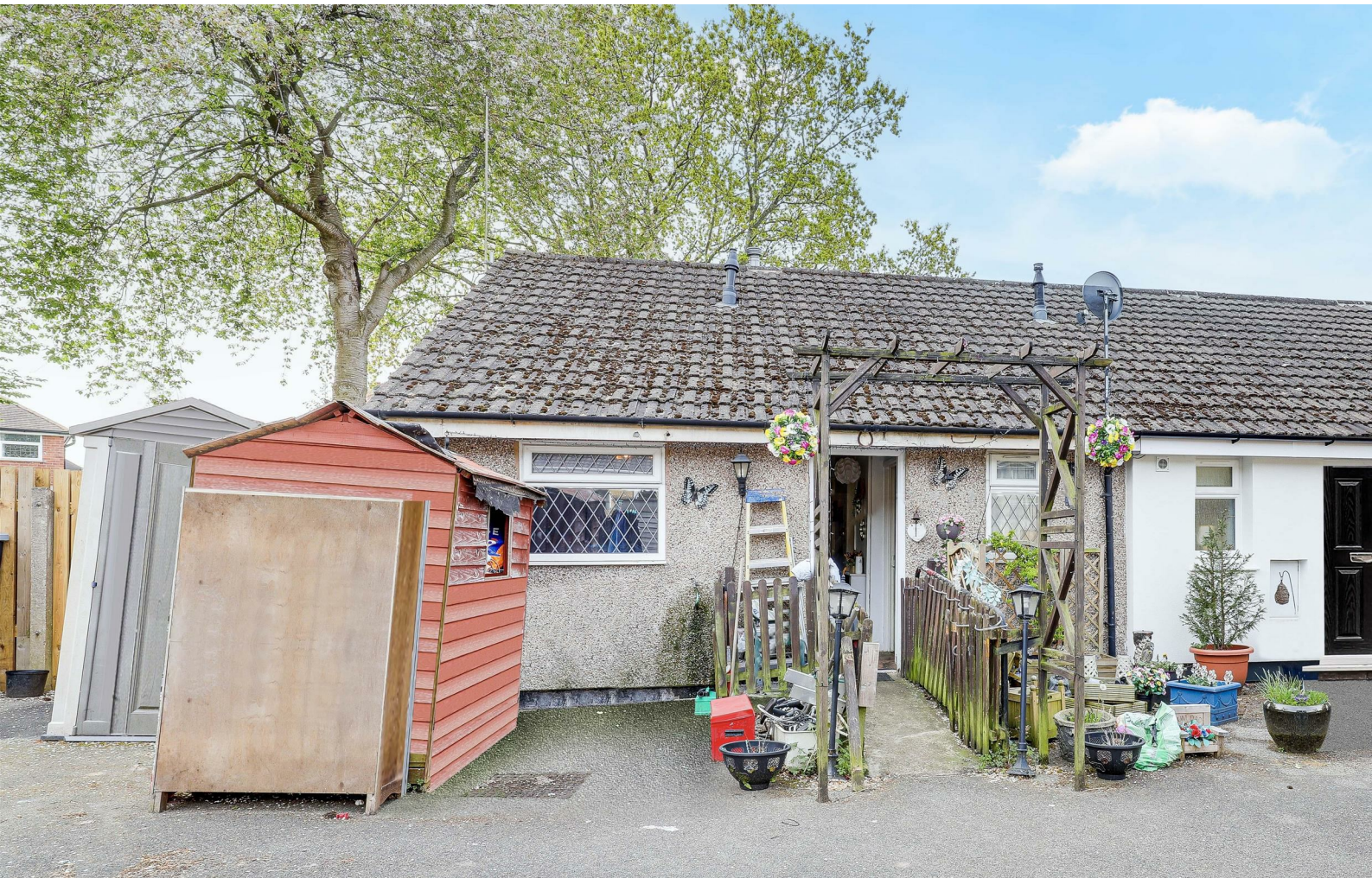
Duchess Gardens, Bulwell, Nottinghamshire NG6 8JS