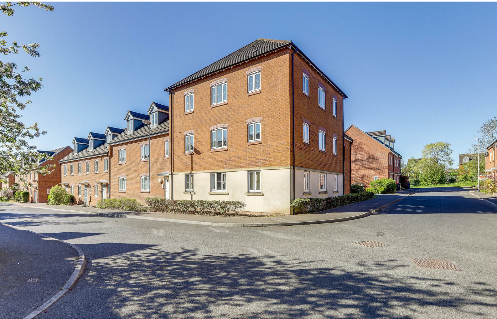
Burberry Avenue, Hucknall, Nottinghamshire NG15 7EZ