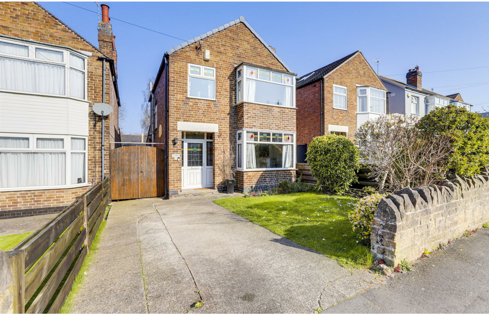
Rowe Gardens, Bulwell, Nottinghamshire NG6 9ER