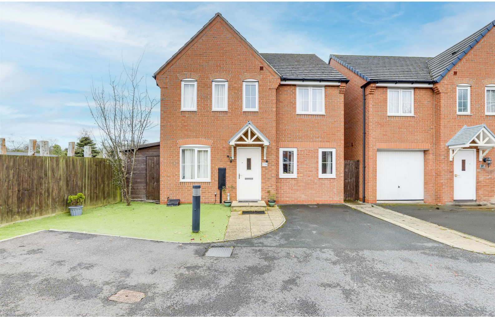
Dexters Grove, Hucknall, Nottinghamshire NG15 6UW