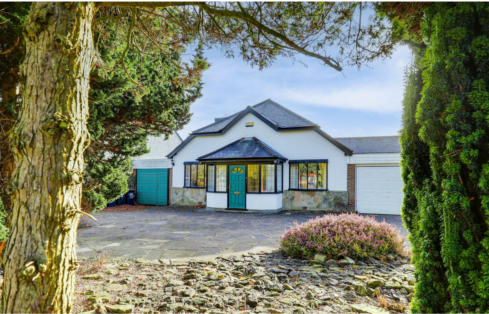
Papplewick Lane, Hucknall, Nottinghamshire NG15 8EH