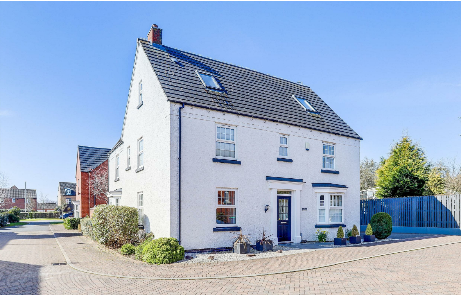
Osprey Grove, Hucknall, Nottinghamshire NG15 8HG