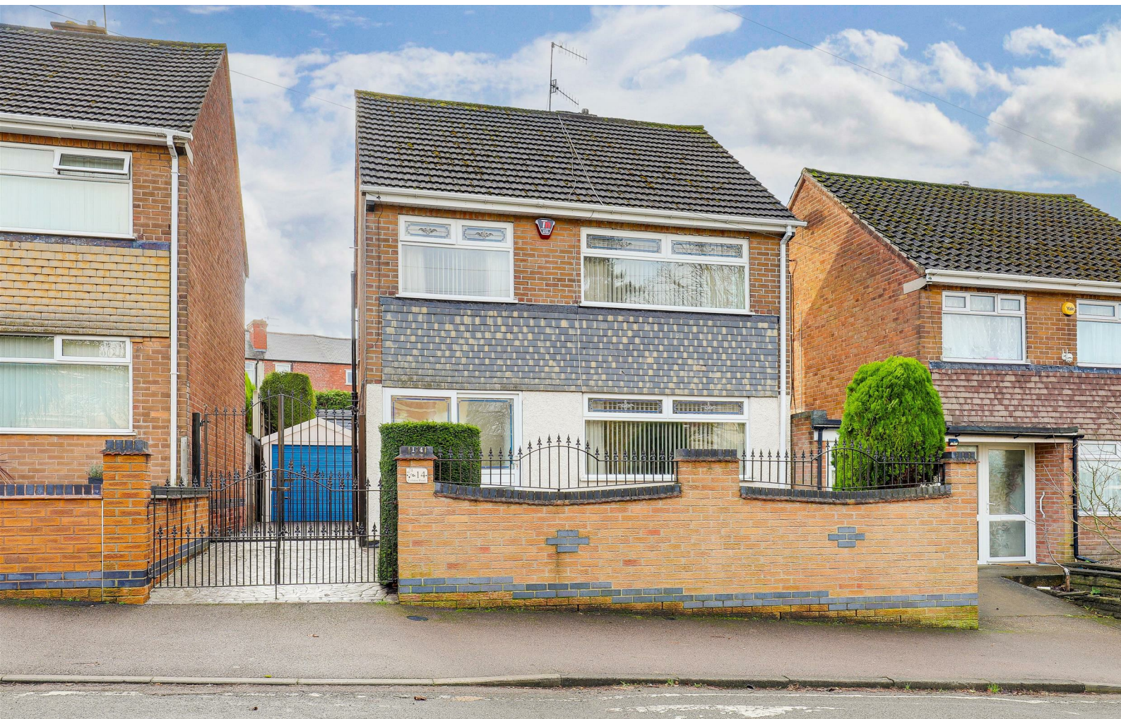
Colston Road, Bulwell, Nottinghamshire NG6 9JY