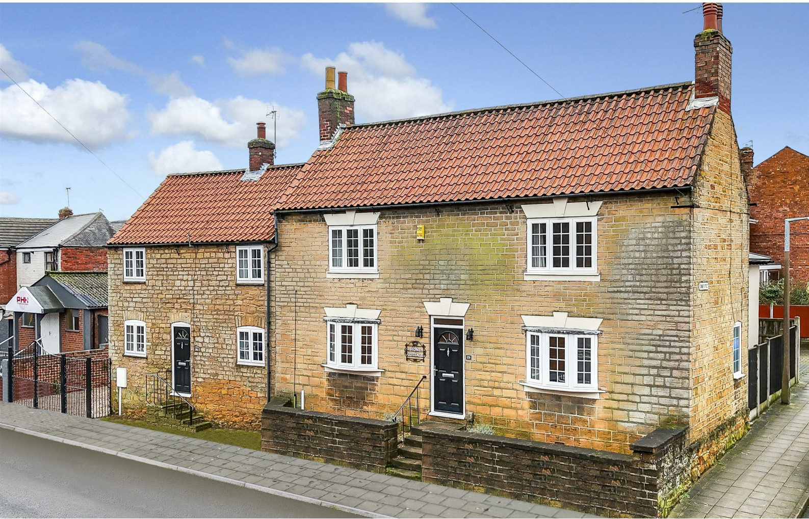
West Street, Hucknall, Nottinghamshire NG15 7BW