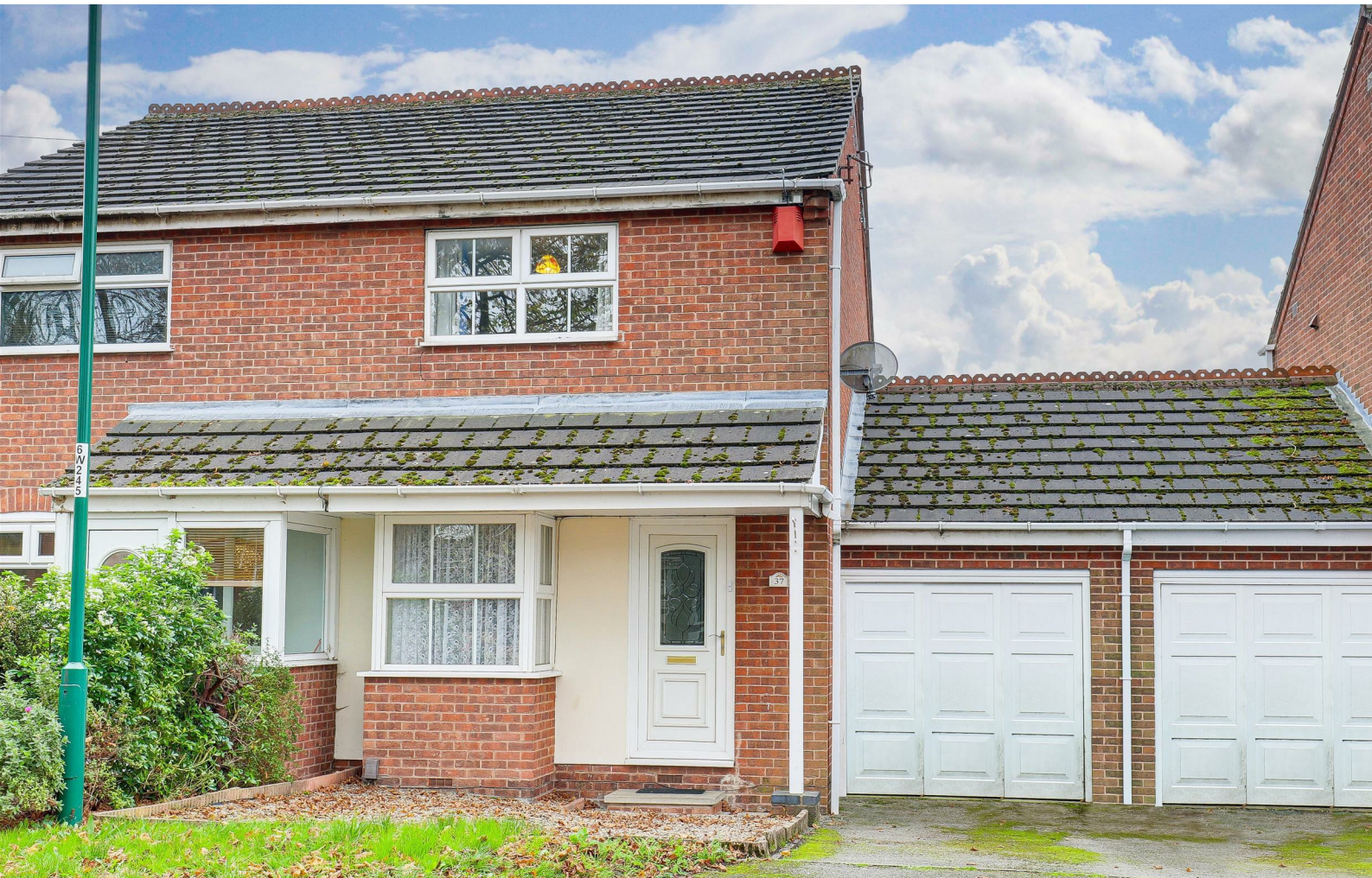
Woodland Avenue, Highbury Vale, Nottinghamshire NG6 9BY