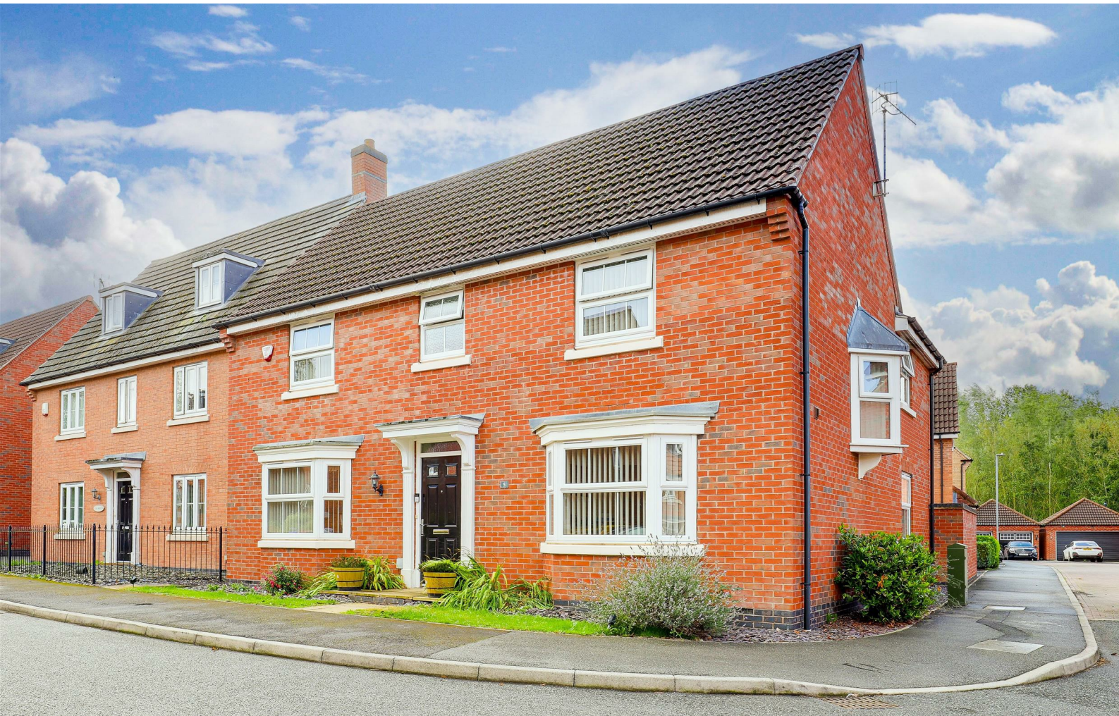
Bowden Avenue, Bestwood Village, Nottinghamshire NG6 8XN