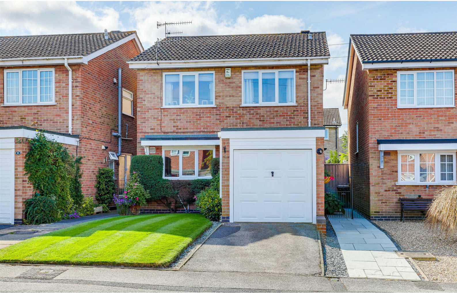
Fairway Drive, Bulwell, Nottinghamshire NG6 9LH