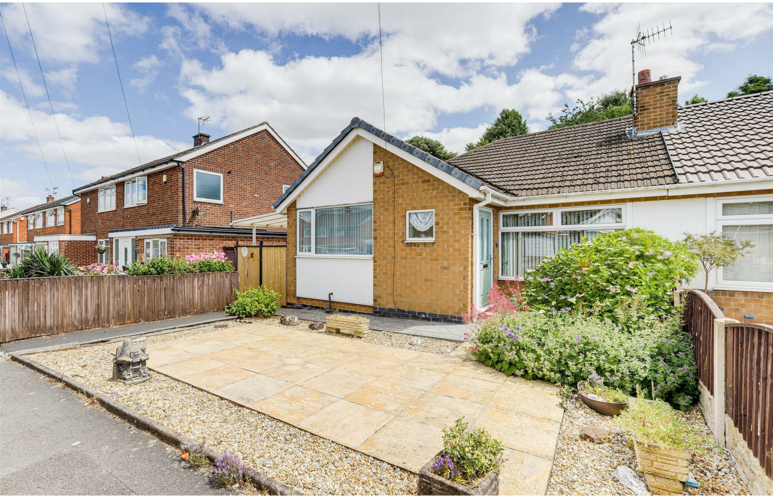
Bestwood Road, Hucknall, Nottinghamshire NG15 7PT