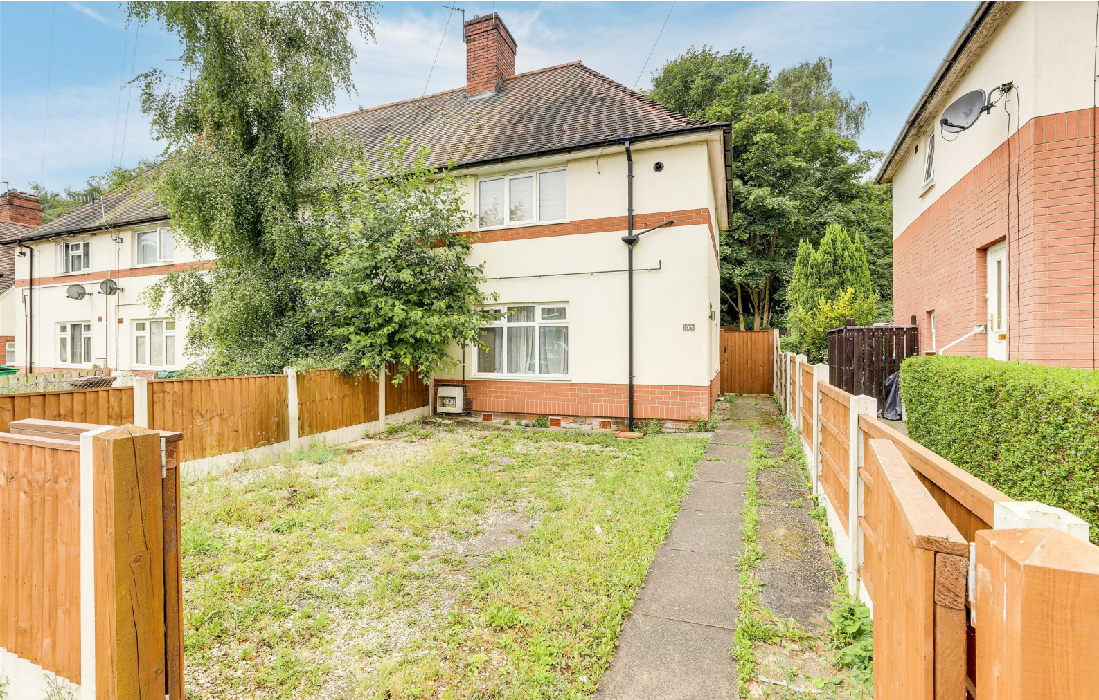
Longford Crescent, Bulwell, Nottinghamshire NG6 8BH