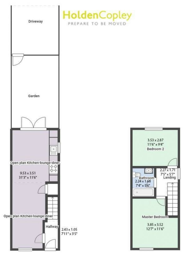
FLOORPLAN IS FOR ILLUSTRATIVE PURPOSES ONLY All measurements walls, doors, windows, fittings and appliances, their sizes and locations are an approximate only. They cannot be regarded as being a representation by the seller nor their agent and is for identification only. Not to scale