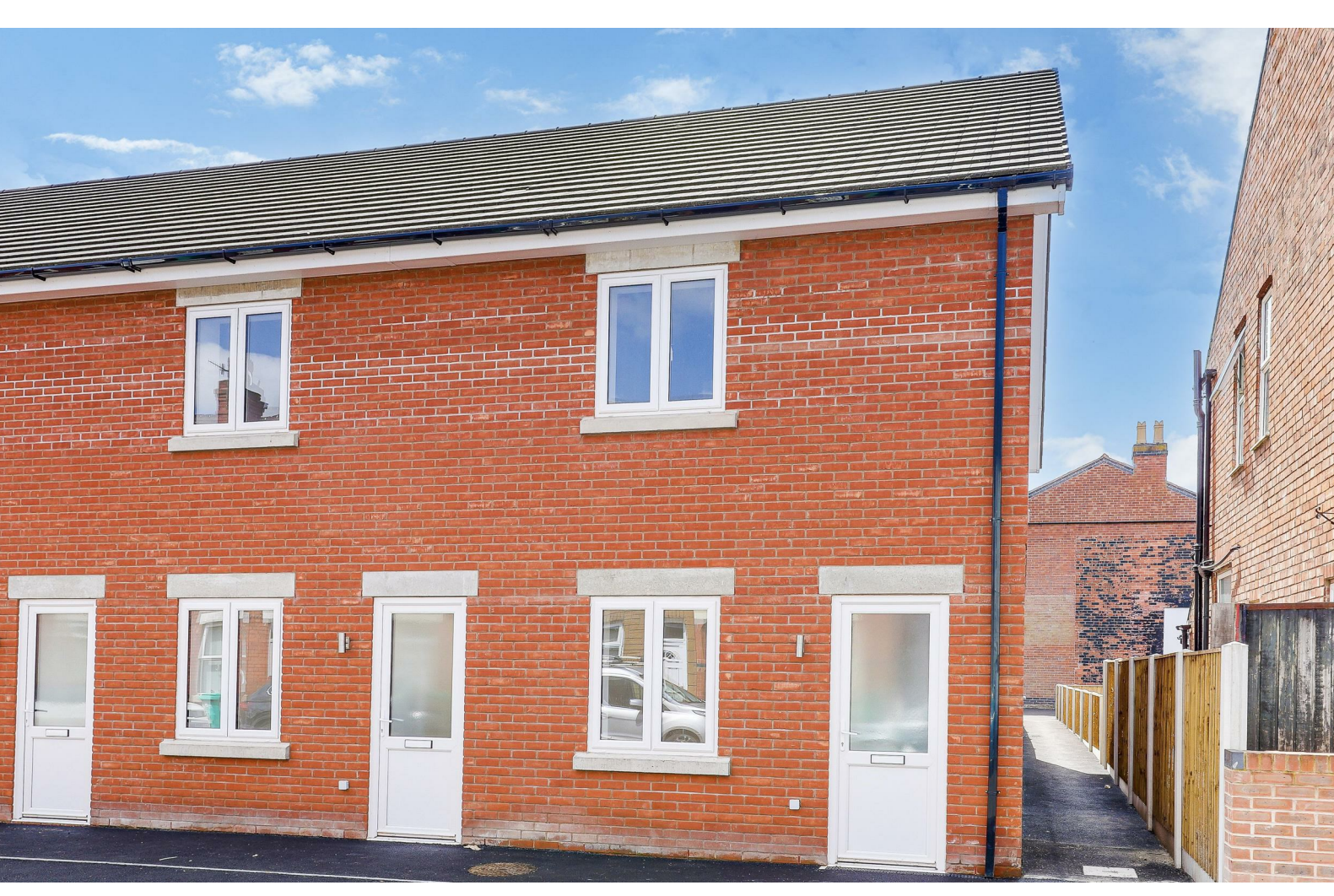
Merchant Street, Bulwell, Nottinghamshire NG6 8GT