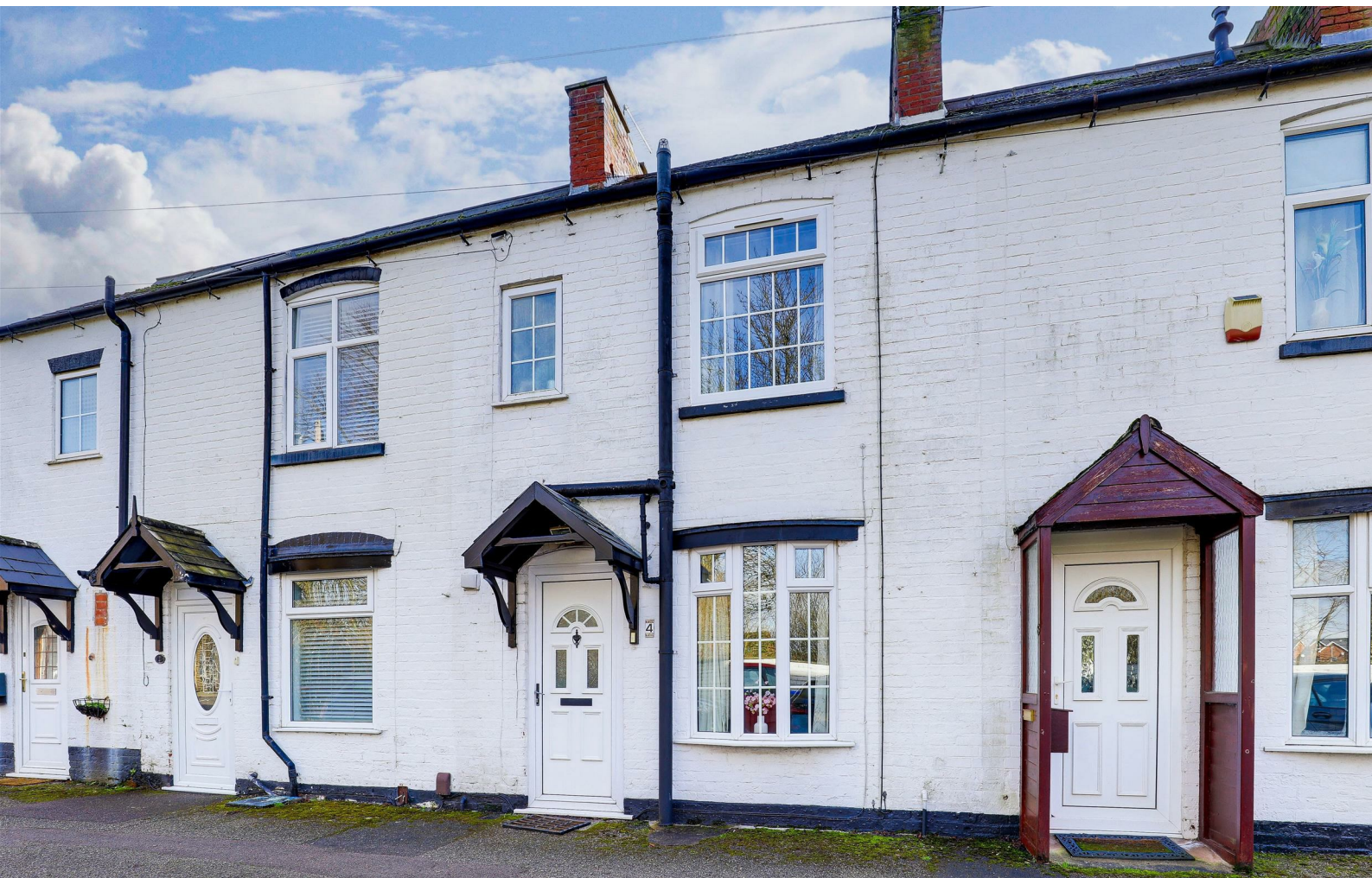
Graingers Terrace, Hucknall, Nottinghamshire NG15 7RG