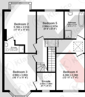
First Floor Floor area 77.0 sq.m. (829 sq.ft.)