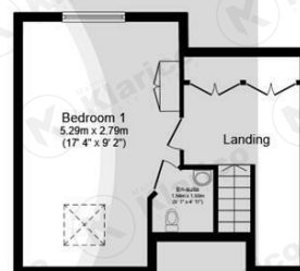
Second Floor Floor area 35.4 sq.m. (381 sq.ft.)