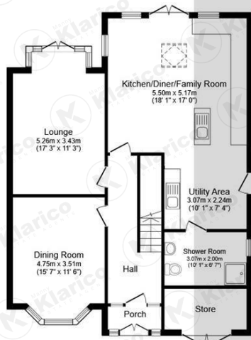
Ground Floor Floor area 92.7 sq.m. (998 sq.ft.)