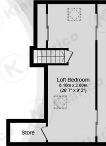
Second Floor Floor area 33.3 sq.m. (358 sq.ft.)