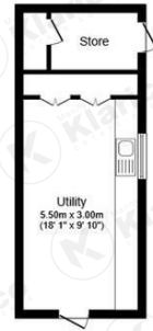
Outbuilding Floor area 23.3 sq.m. (251 sq.ft.)