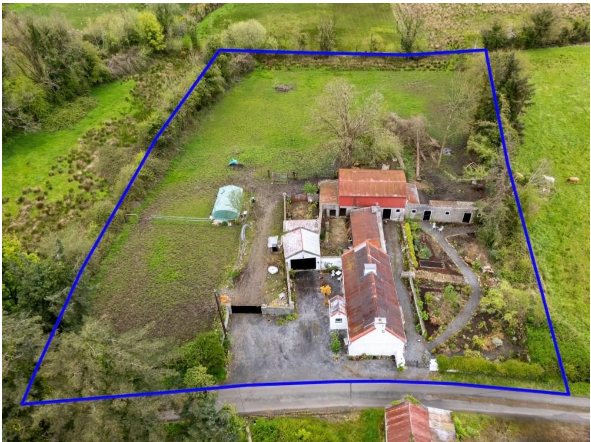
Residence On C. 1.16 Acres, Sheehaun (Morton), Curraghroe, F42 KR44