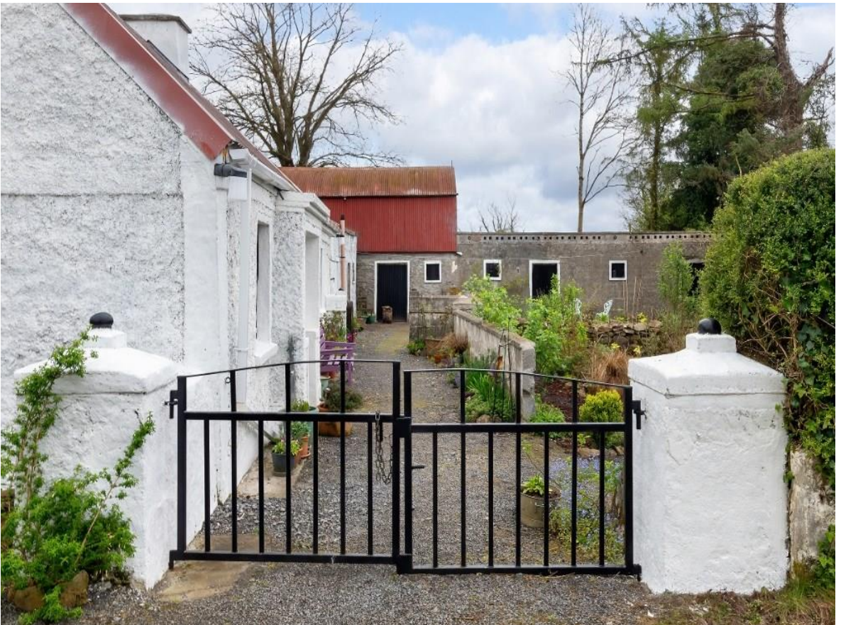
Residence On C. 1.16 Acres, Sheehaun (Morton), Curraghroe, F42 KR44