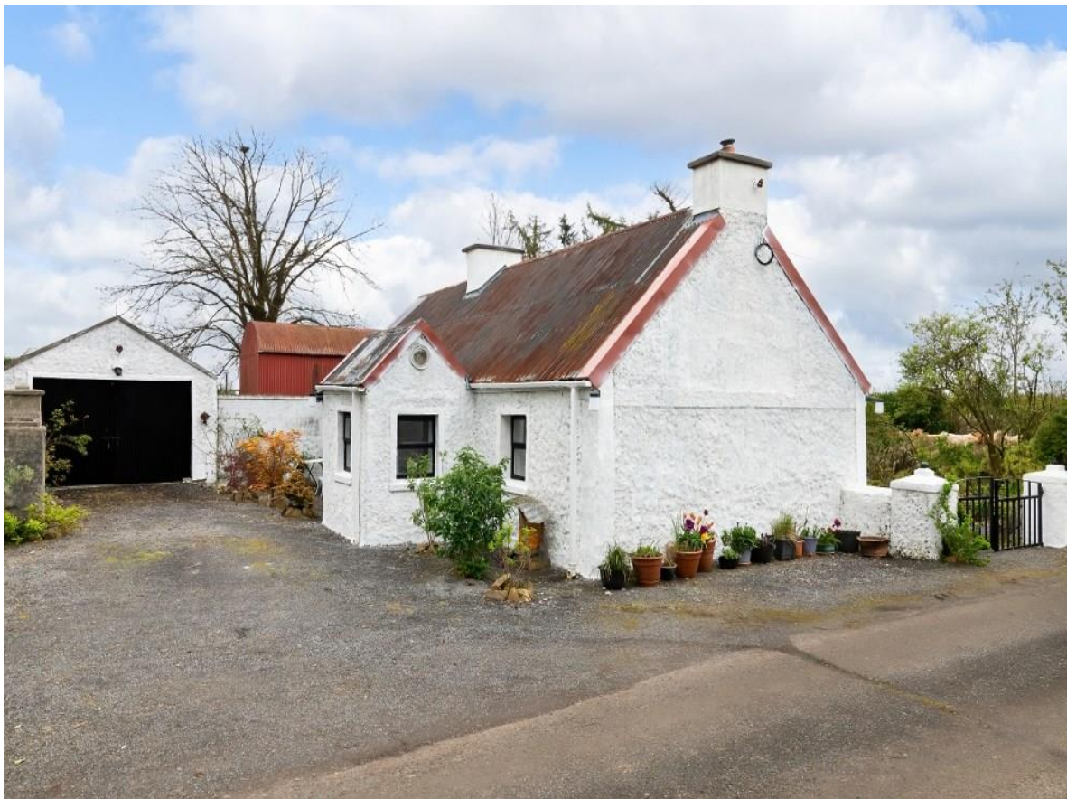
Residence On C. 1.16 Acres, Sheehaun (Morton), Curraghroe, F42 KR44