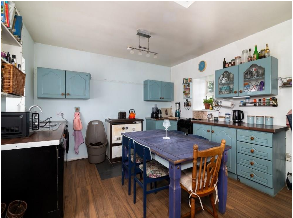
Residence On C. 1.16 Acres, Sheehaun (Morton), Curraghroe, F42 KR44