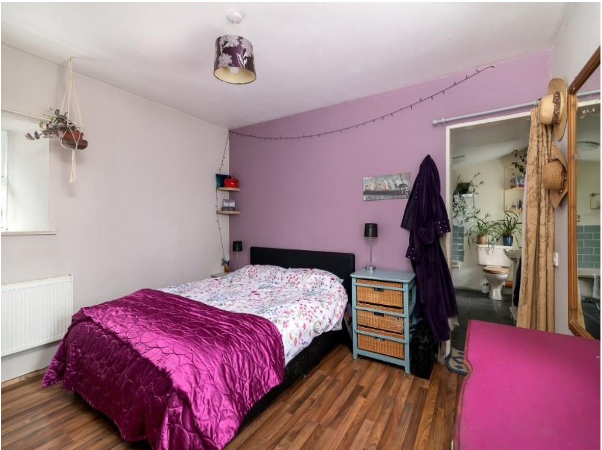
Residence On C. 1.16 Acres, Sheehaun (Morton), Curraghroe, F42 KR44