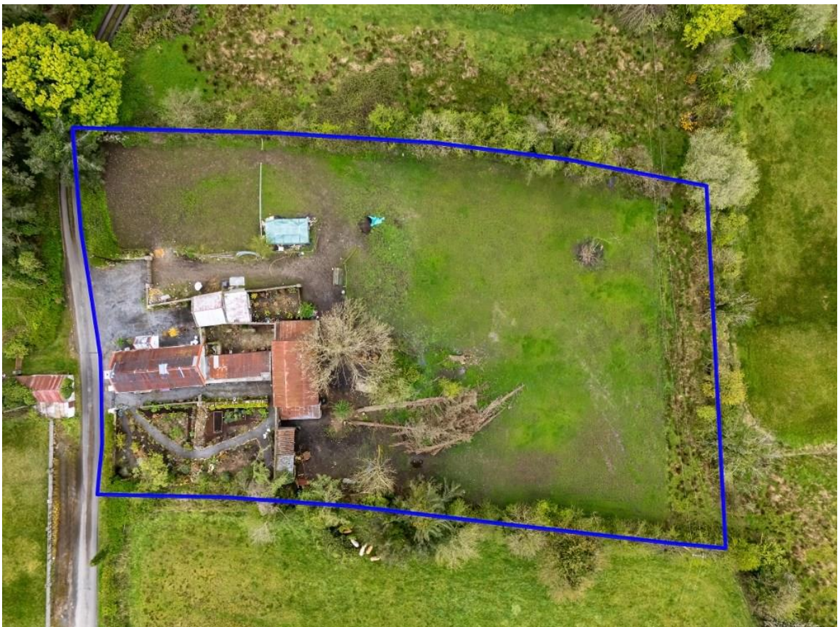
Residence On C. 1.16 Acres, Sheehaun (Morton), Curraghroe, F42 KR44