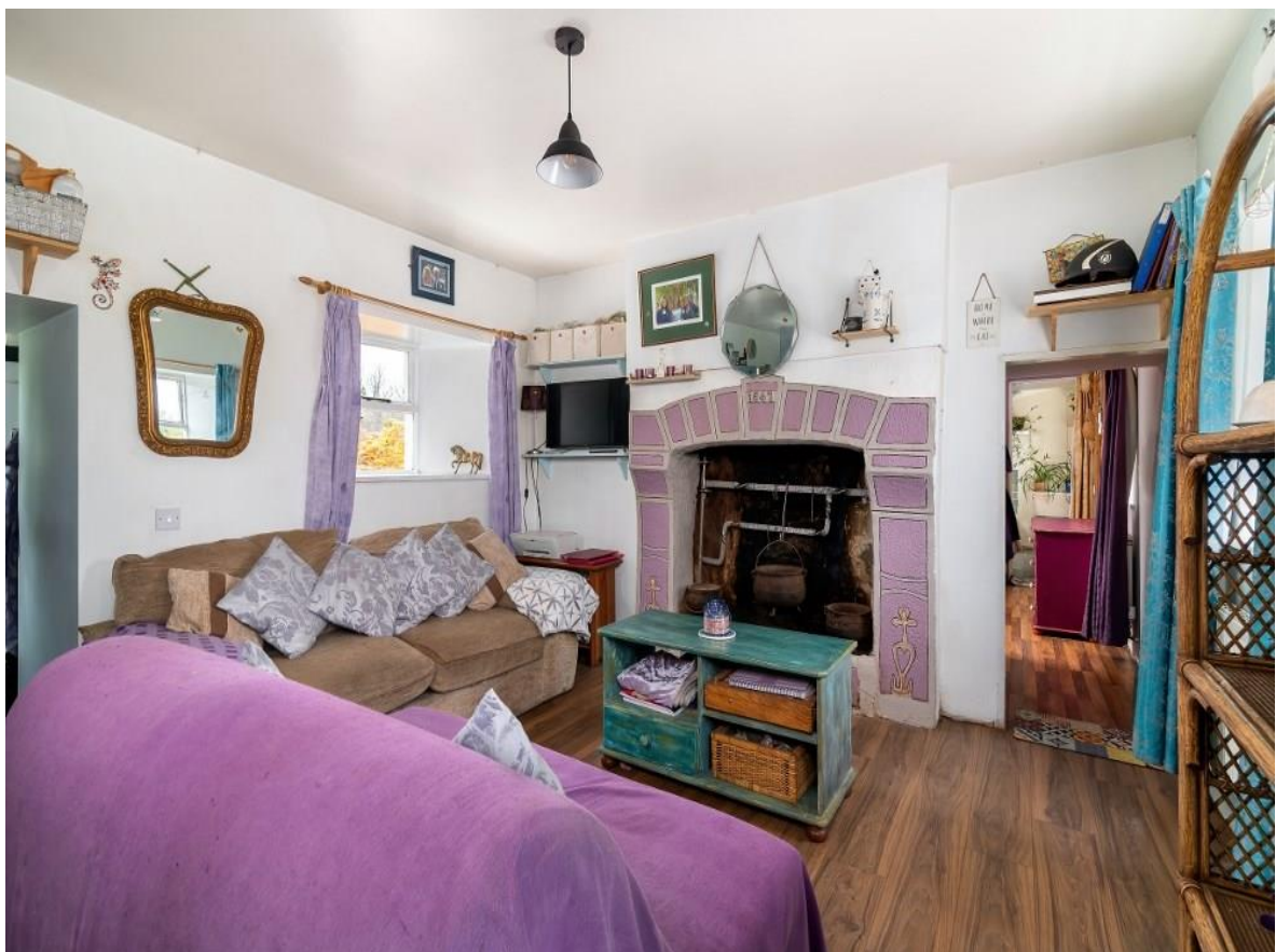
Residence On C. 1.16 Acres, Sheehaun (Morton), Curraghroe, F42 KR44