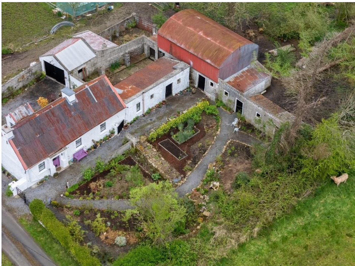
Residence On C. 1.16 Acres, Sheehaun (Morton), Curraghroe, F42 KR44