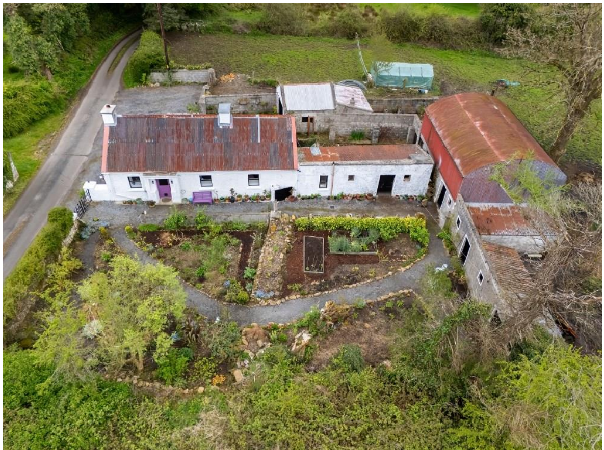
Residence On C. 1.16 Acres, Sheehaun (Morton), Curraghroe, F42 KR44