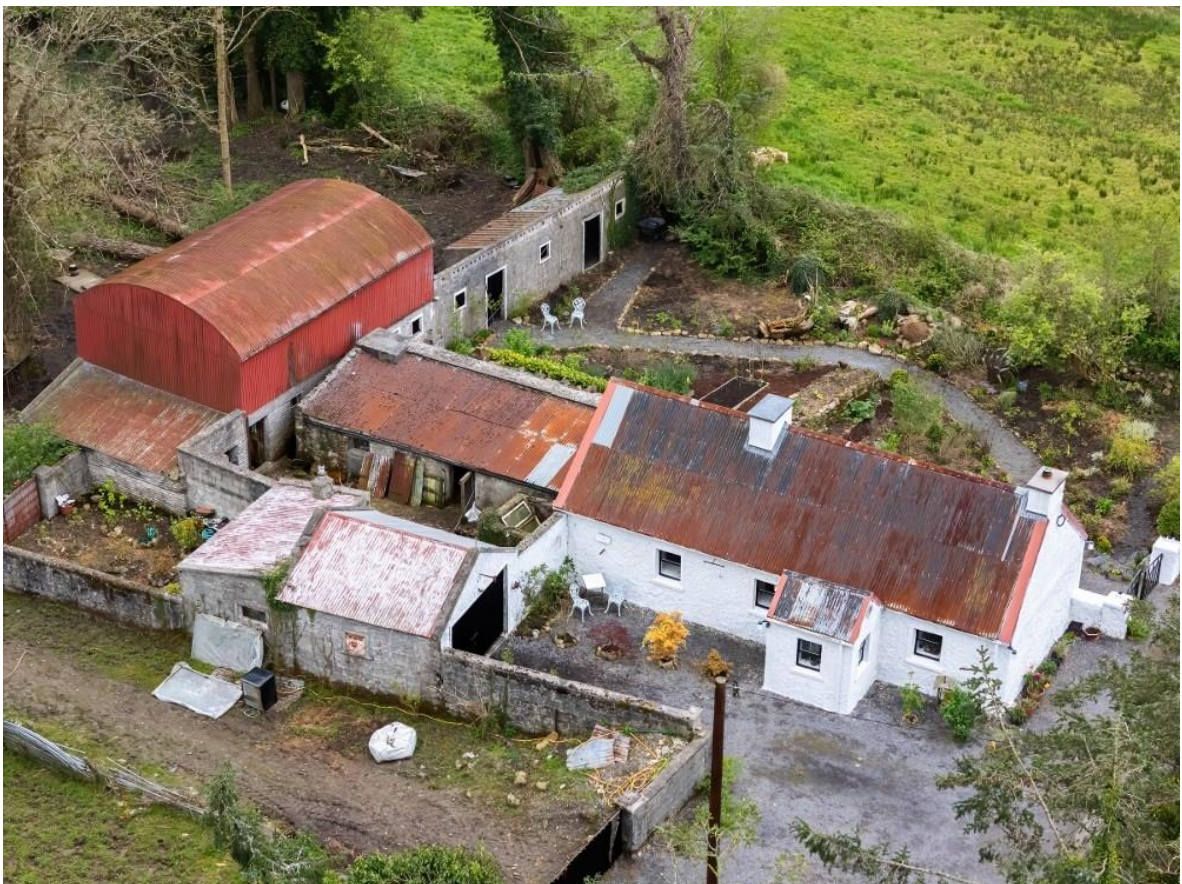
Residence On C. 1.16 Acres, Sheehaun (Morton), Curraghroe, F42 KR44