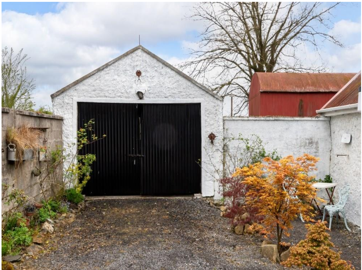
Residence On C. 1.16 Acres, Sheehaun (Morton), Curraghroe, F42 KR44