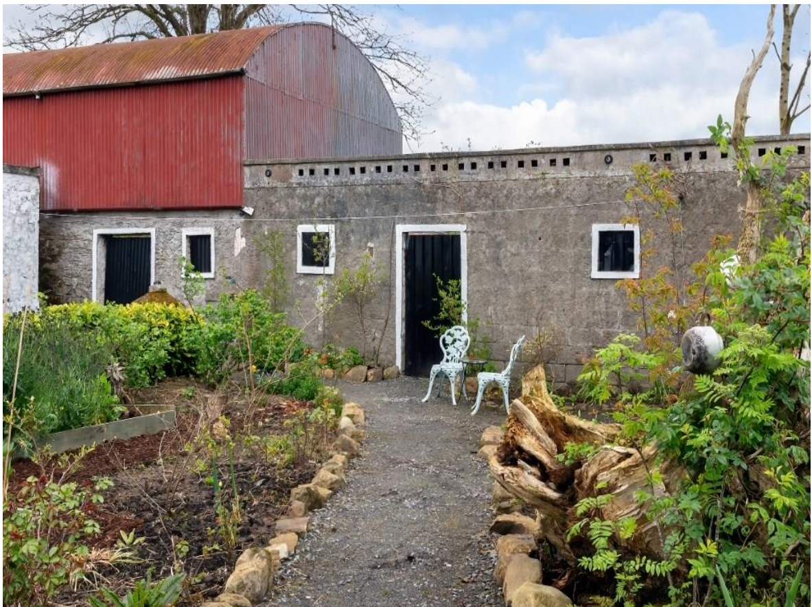
Residence On C. 1.16 Acres, Sheehaun (Morton), Curraghroe, F42 KR44