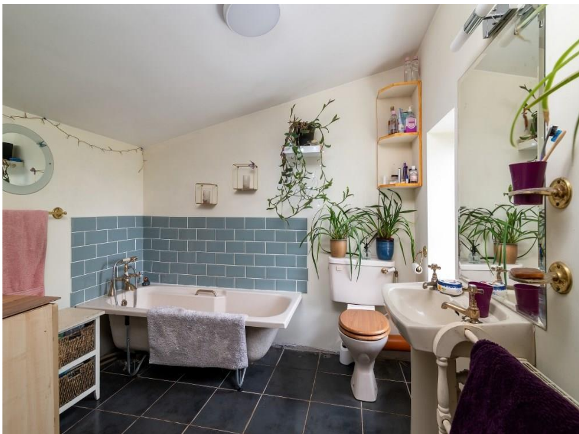
Residence On C. 1.16 Acres, Sheehaun (Morton), Curraghroe, F42 KR44