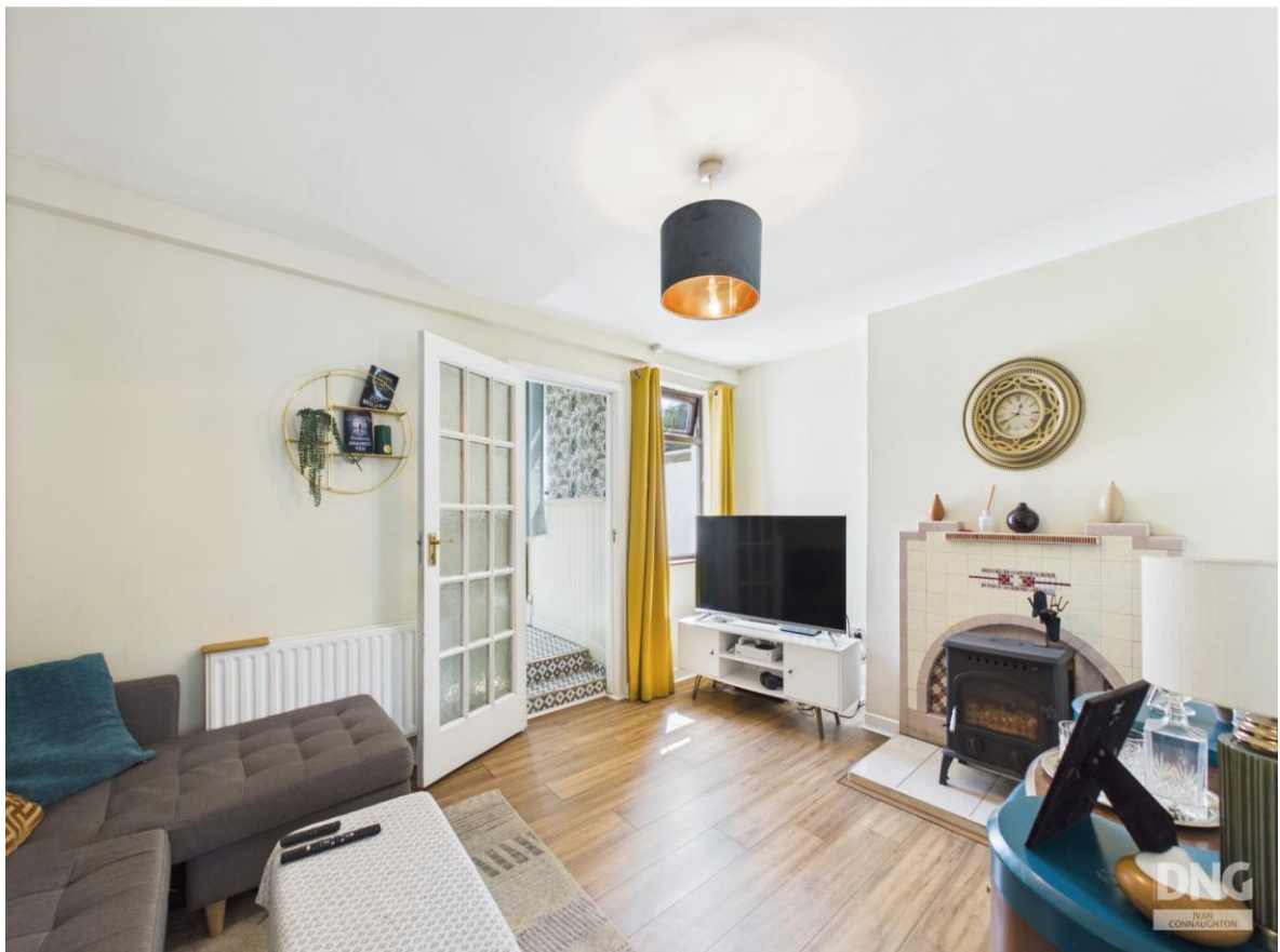
2 St. Kevins Terrace, Church Road, Castlerea, Co. Roscommon. F45 HR74