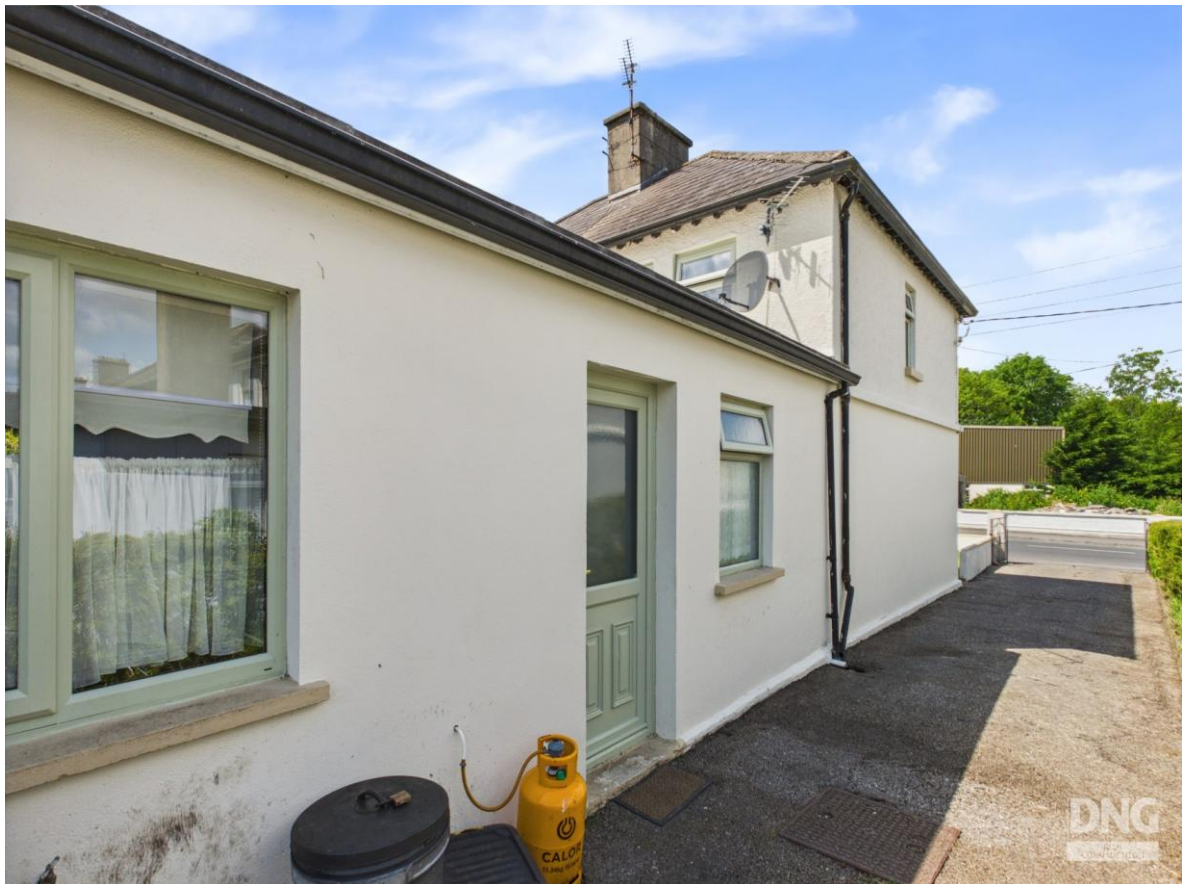
2 St. Kevins Terrace, Church Road, Castlerea, Co. Roscommon. F45 HR74