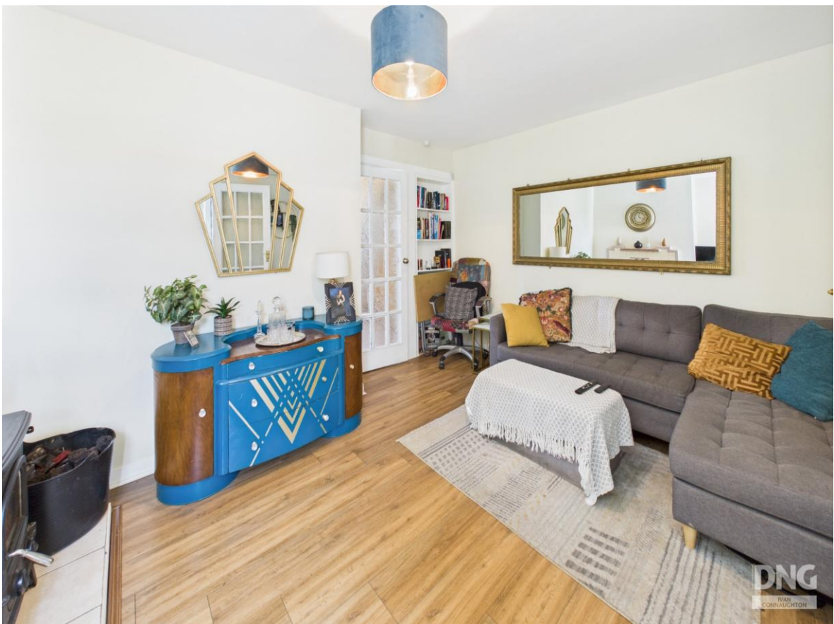
2 St. Kevins Terrace, Church Road, Castlerea, Co. Roscommon. F45 HR74