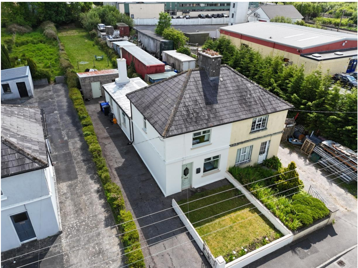
2 St. Kevins Terrace, Church Road, Castlerea, Co. Roscommon. F45 HR74