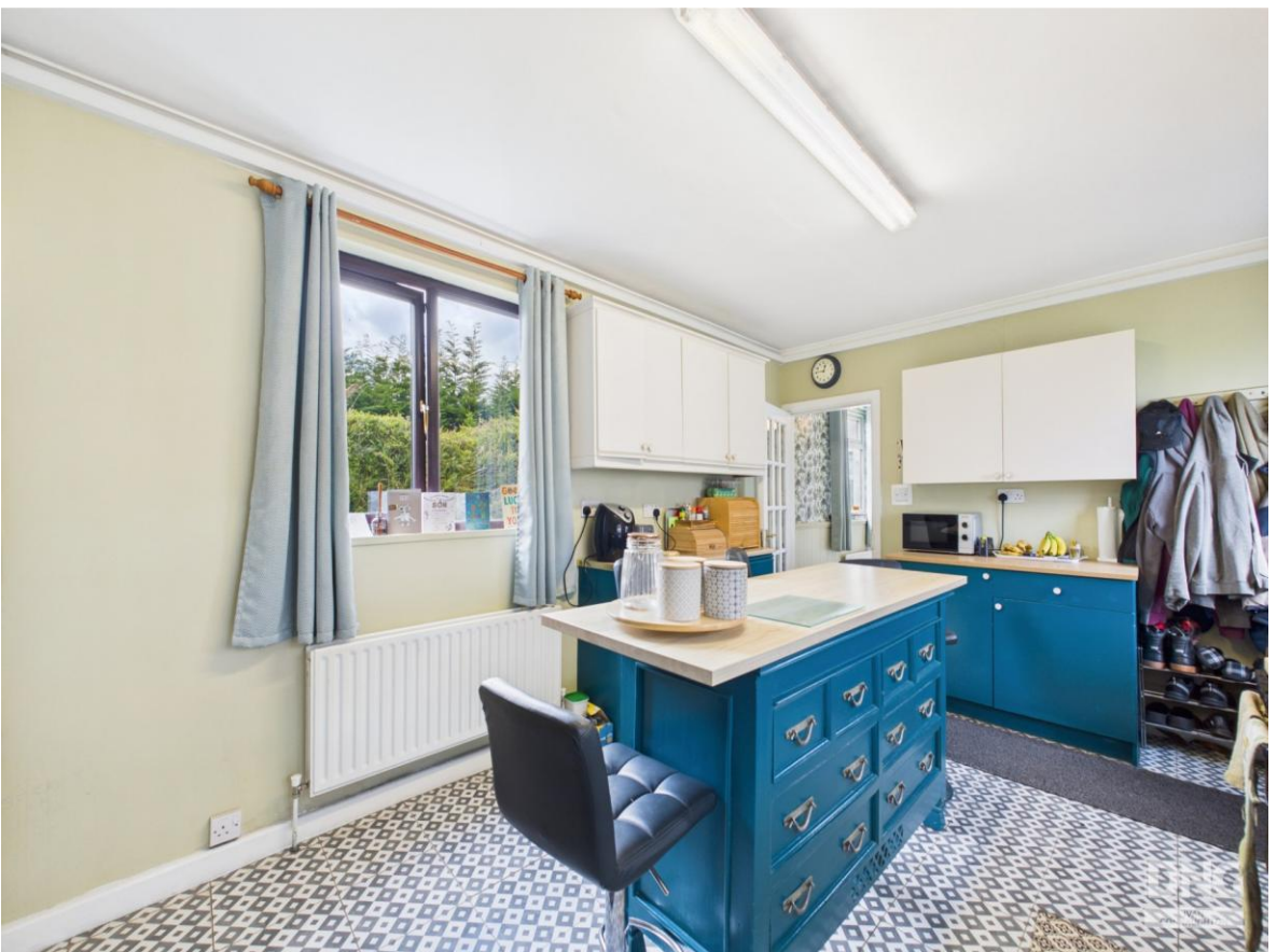
2 St. Kevins Terrace, Church Road, Castlerea, Co. Roscommon. F45 HR74