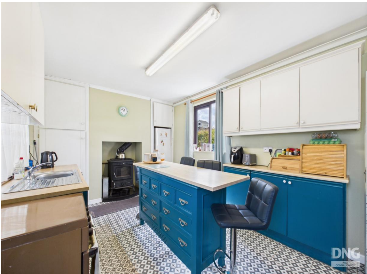
2 St. Kevins Terrace, Church Road, Castlerea, Co. Roscommon. F45 HR74