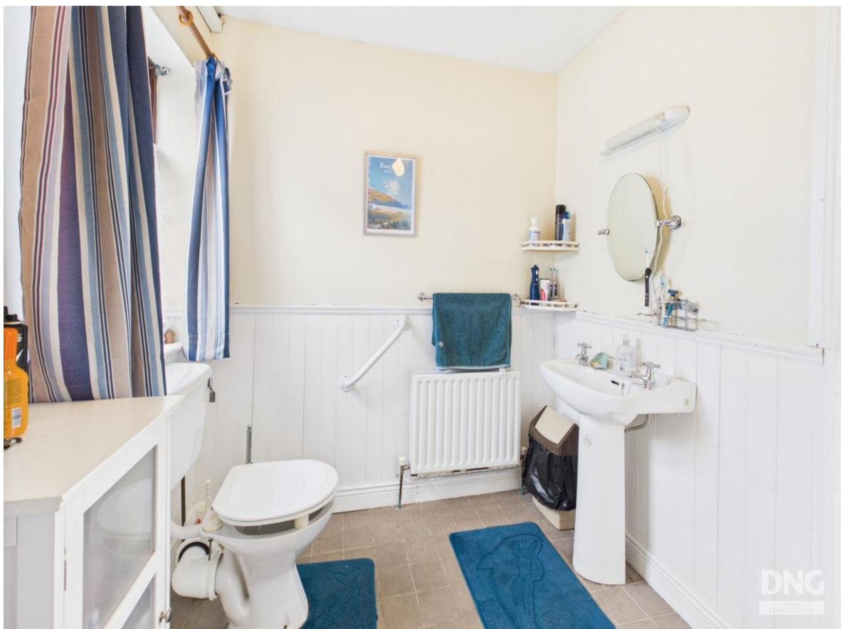
2 St. Kevins Terrace, Church Road, Castlerea, Co. Roscommon. F45 HR74