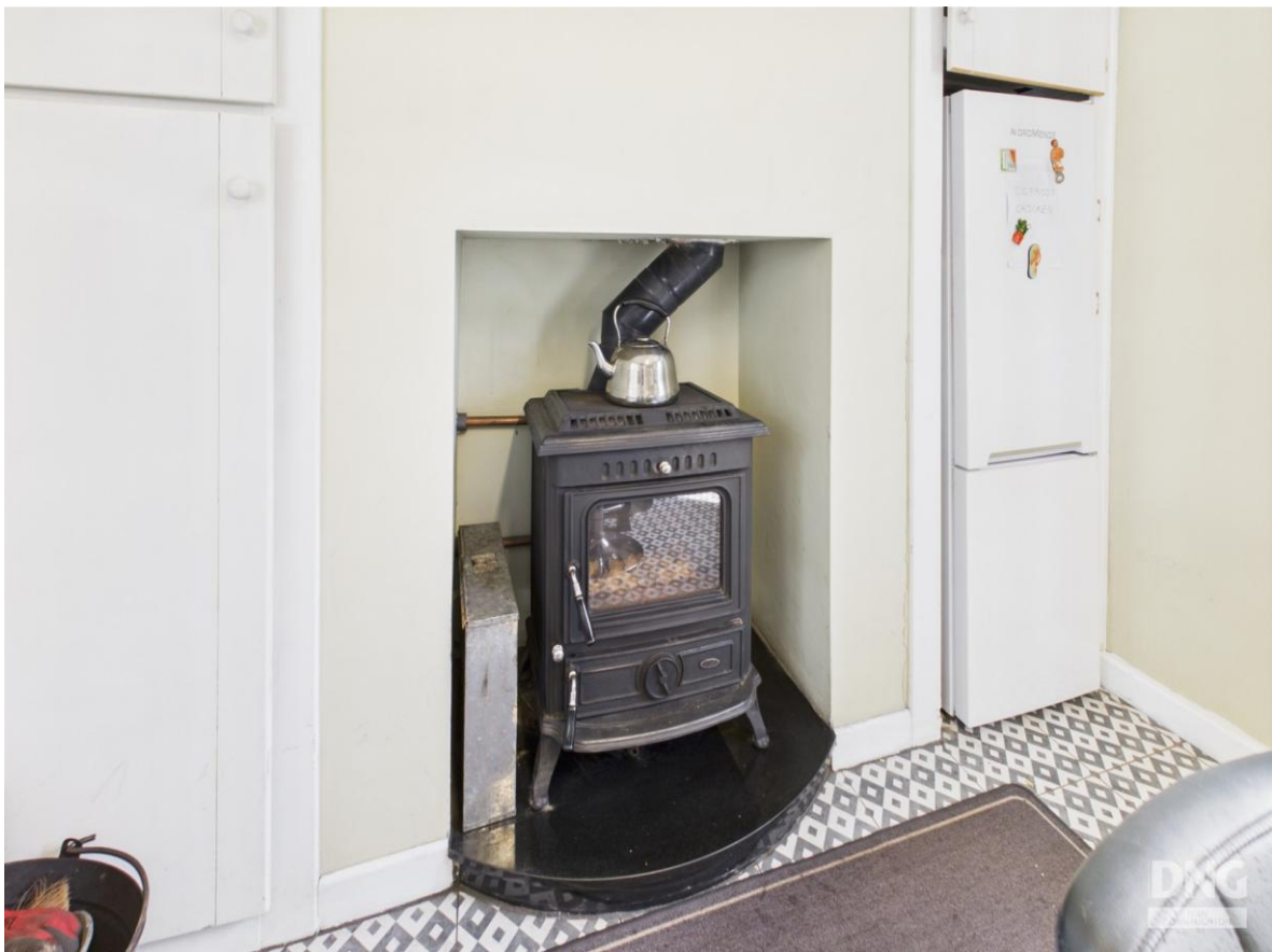
2 St. Kevins Terrace, Church Road, Castlerea, Co. Roscommon. F45 HR74