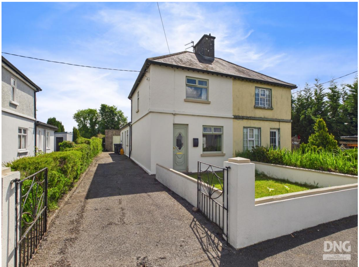
2 St. Kevins Terrace, Church Road, Castlerea, Co. Roscommon. F45 HR74