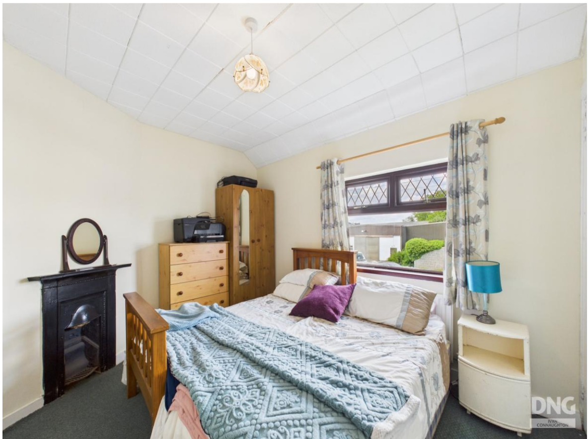
2 St. Kevins Terrace, Church Road, Castlerea, Co. Roscommon. F45 HR74