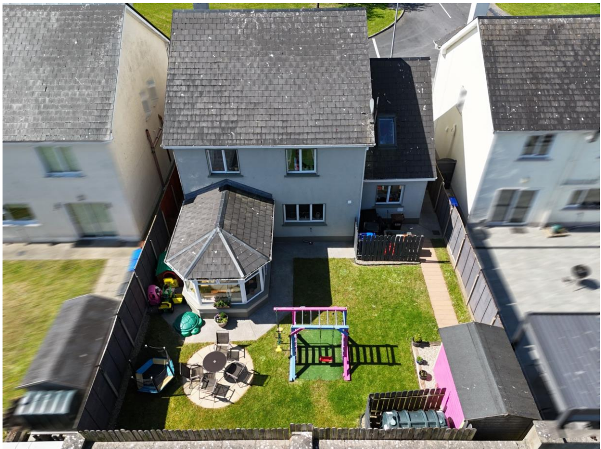
13 The Paddock, Athleague, Co. Roscommon. F42 YN63