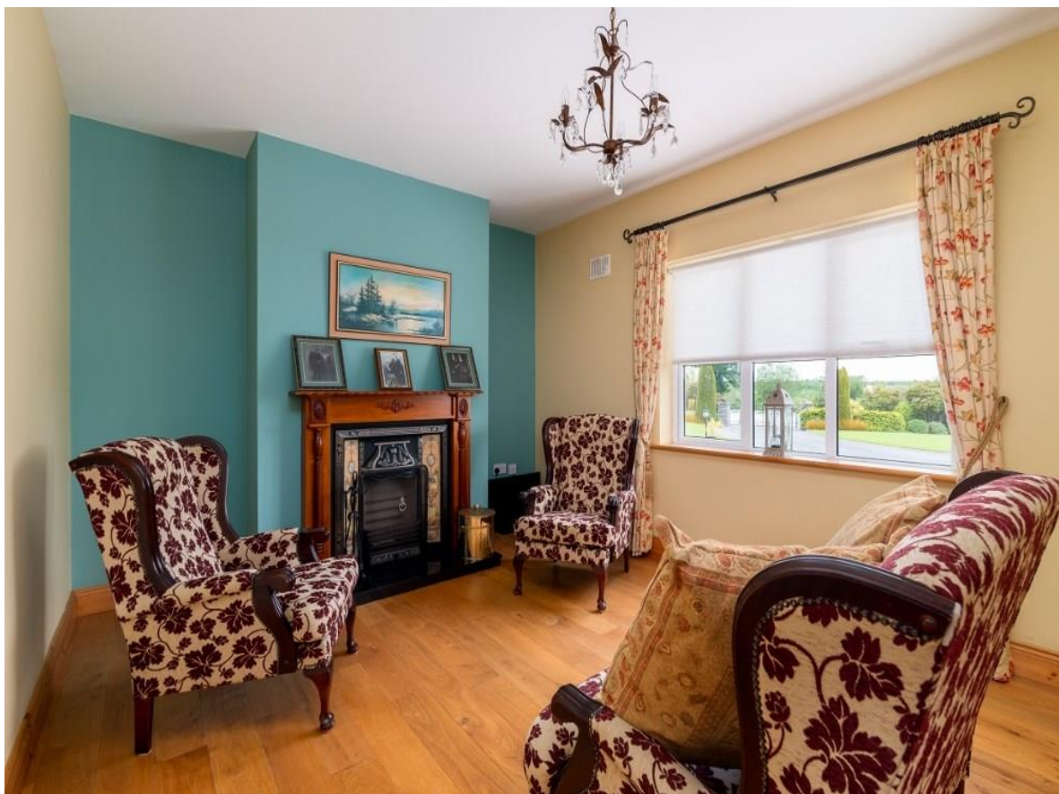
`Solas Bhríde`, Cloonsellan, Ballymurray, Co. Roscommon. F42 NX81