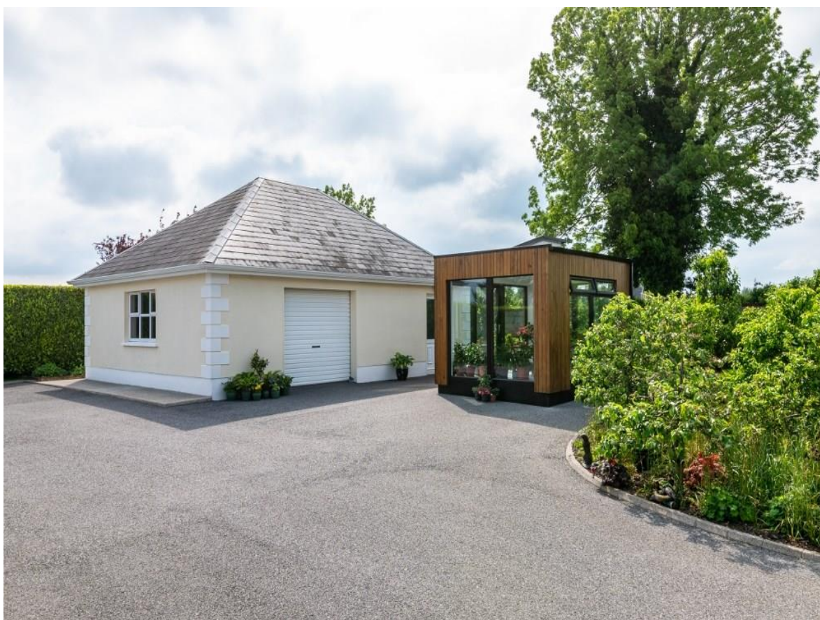
`Solas Bhríde`, Cloonsellan, Ballymurray, Co. Roscommon. F42 NX81