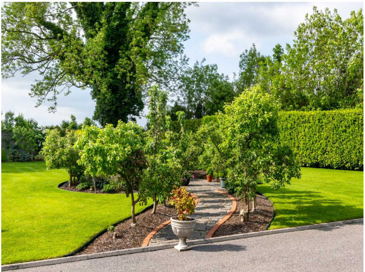
`Solas Bhríde`, Cloonsellan, Ballymurray, Co. Roscommon. F42 NX81