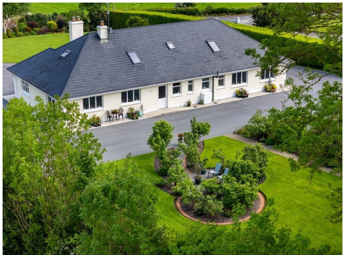
`Solas Bhríde`, Cloonsellan, Ballymurray, Co. Roscommon. F42 NX81