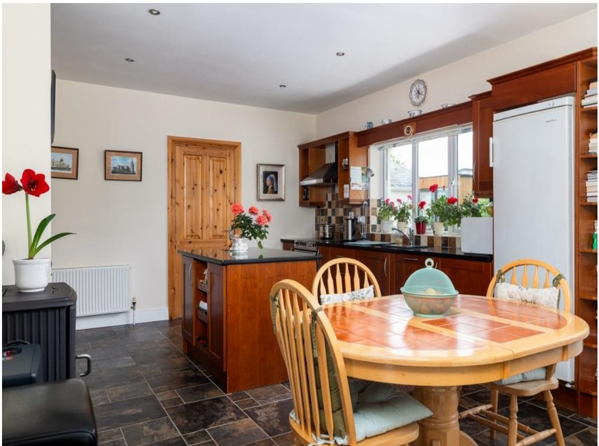
`Solas Bhríde`, Cloonsellan, Ballymurray, Co. Roscommon. F42 NX81