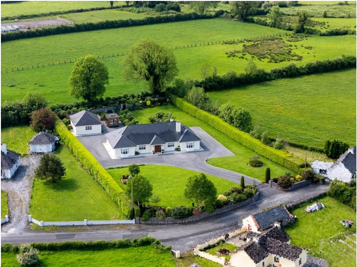
`Solas Bhríde`, Cloonsellan, Ballymurray, Co. Roscommon. F42 NX81