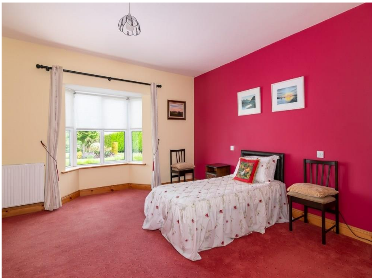
`Solas Bhríde`, Cloonsellan, Ballymurray, Co. Roscommon. F42 NX81