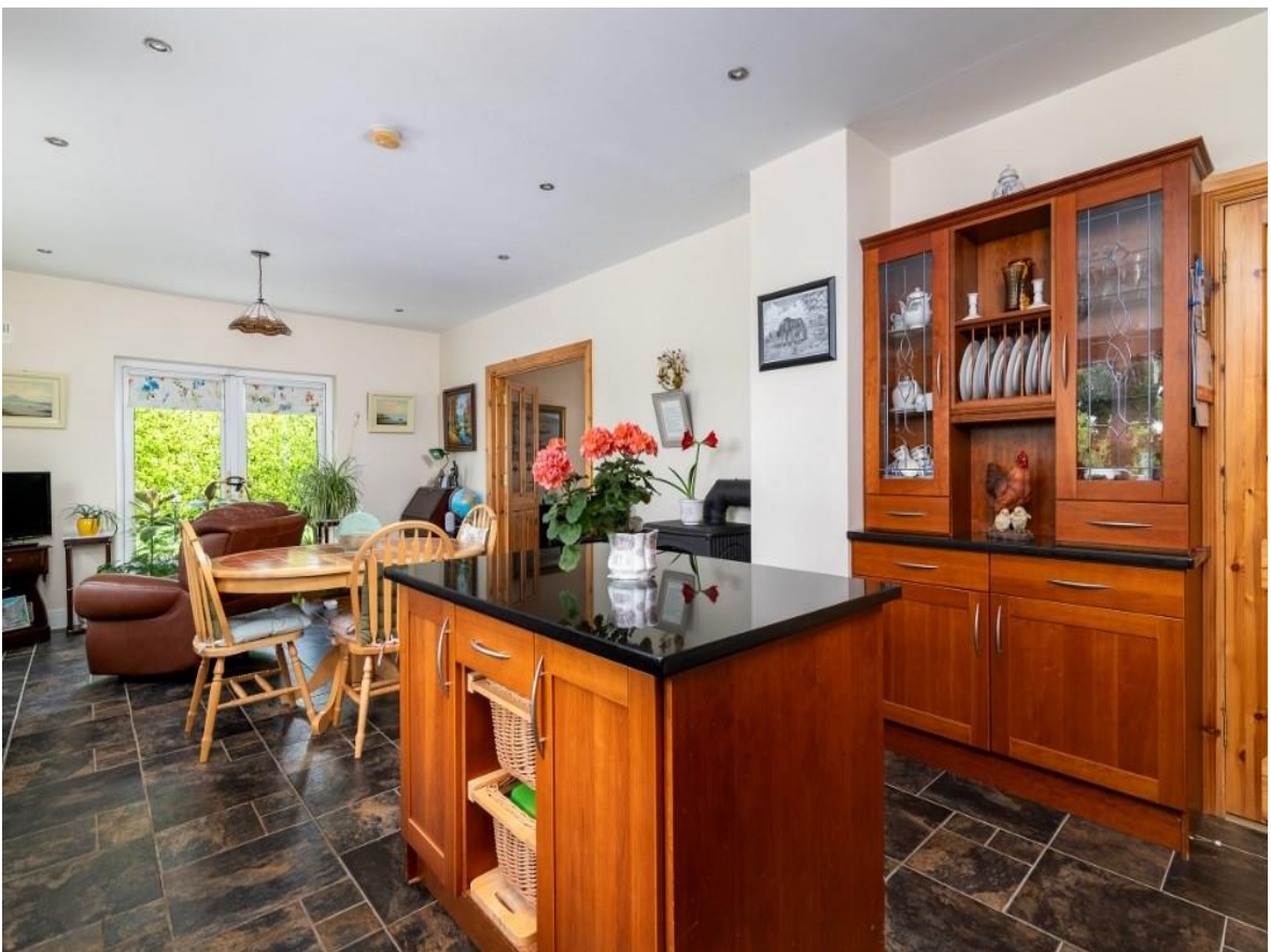
`Solas Bhride`, Cloonsellan, Ballymurray, Co. Roscommon. F42 NX81