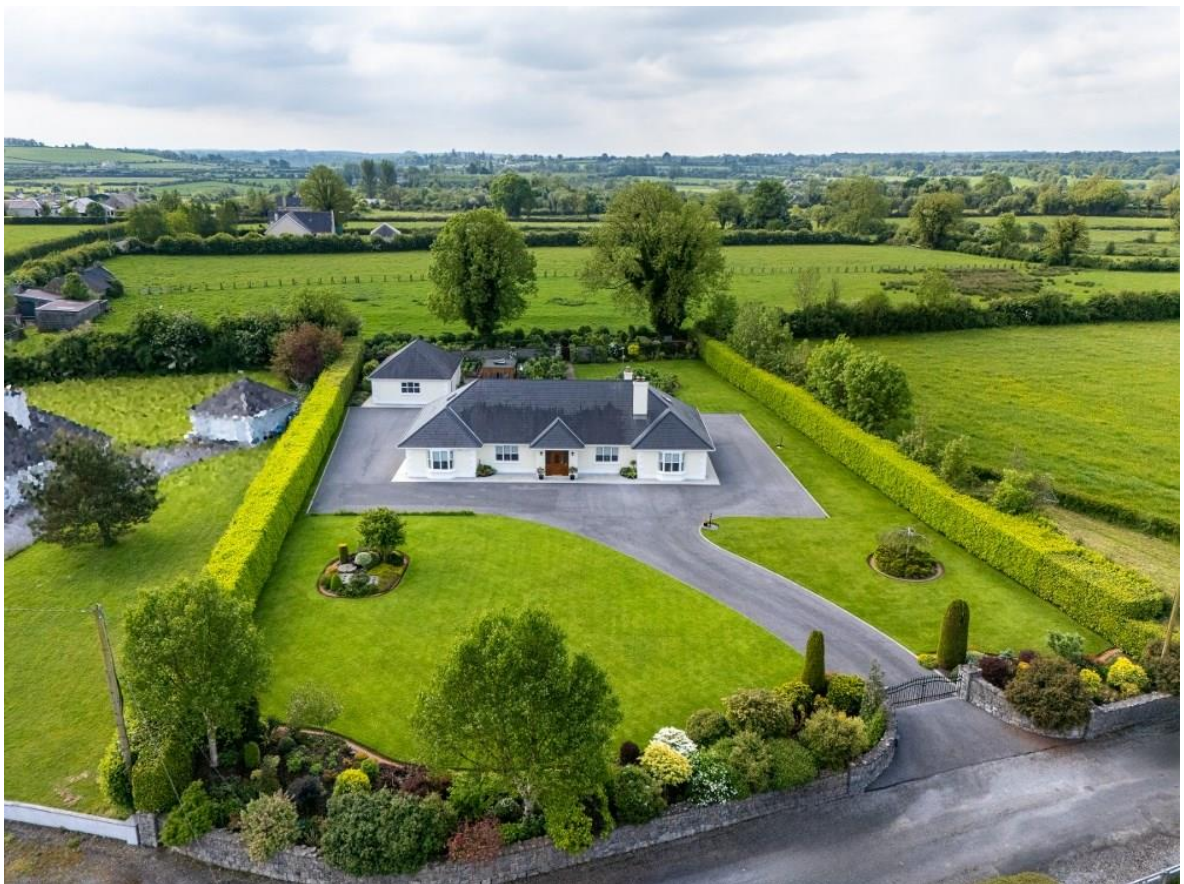
`Solas Bhríde`, Cloonsellan, Ballymurray, Co. Roscommon. F42 NX81