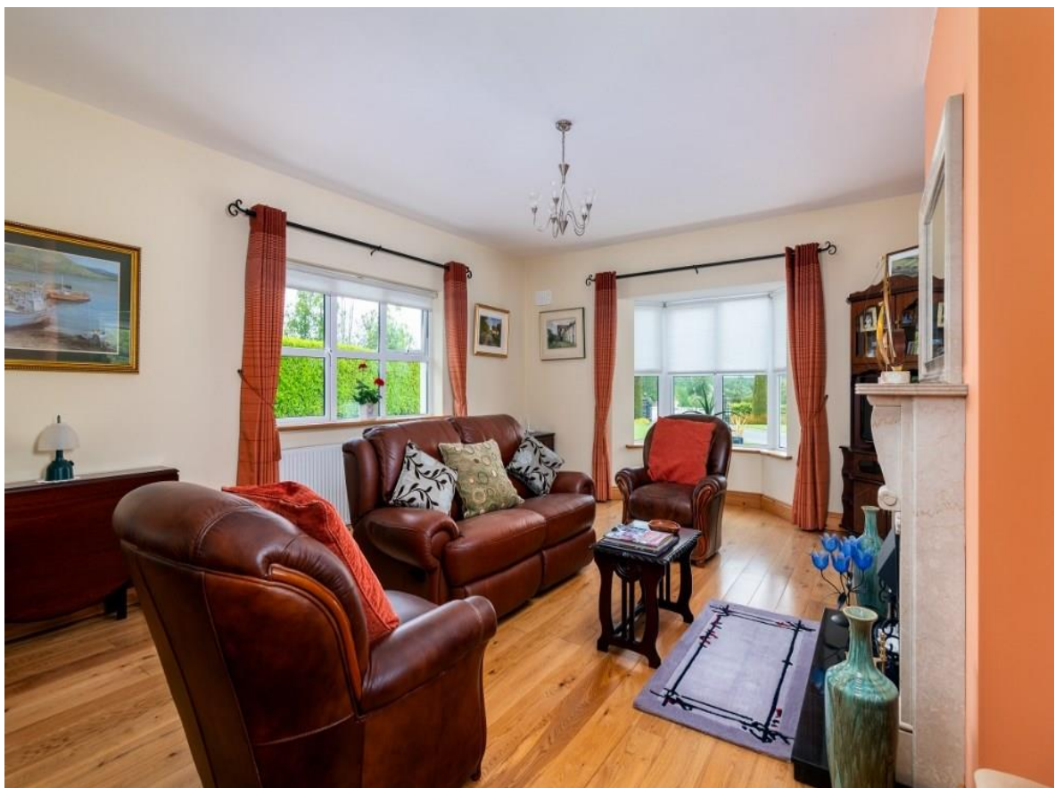
`Solas Bhríde`, Cloonsellan, Ballymurray, Co. Roscommon. F42 NX81