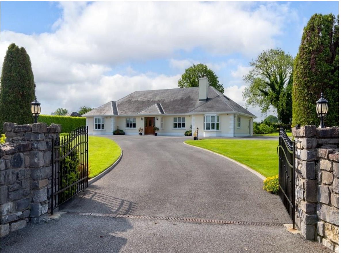
`Solas Bhríde`, Cloonsellan, Ballymurray, Co. Roscommon. F42 NX81