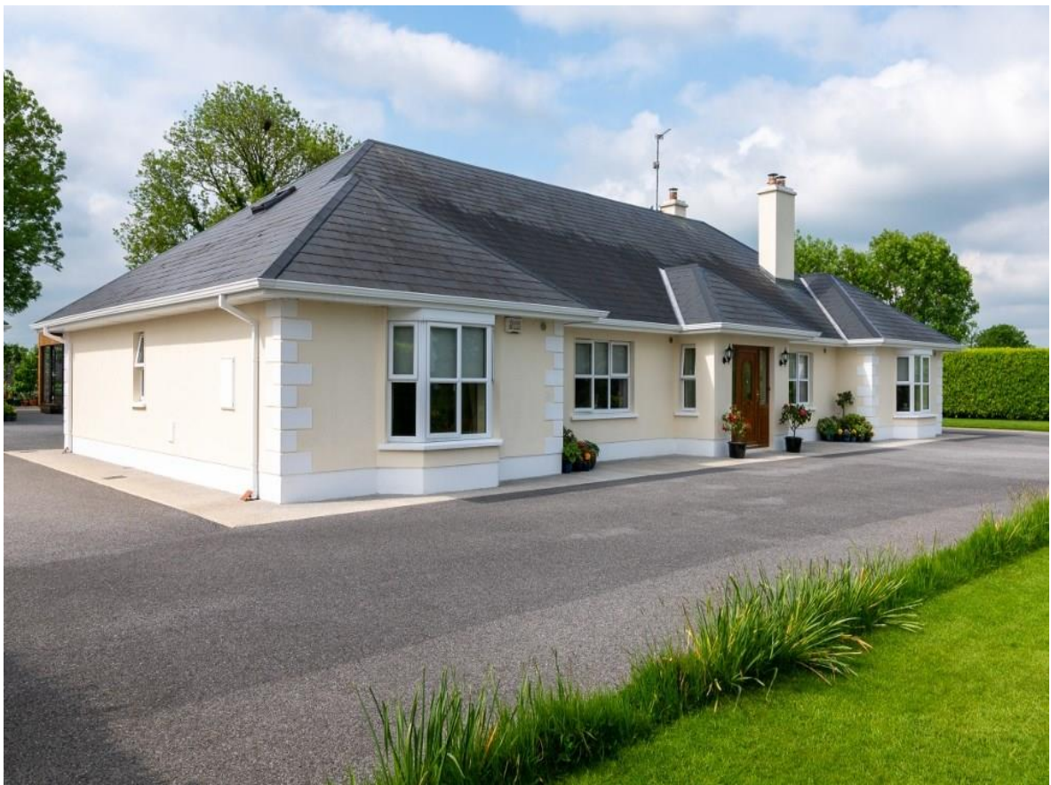
`Solas Bhríde`, Cloonsellan, Ballymurray, Co. Roscommon. F42 NX81