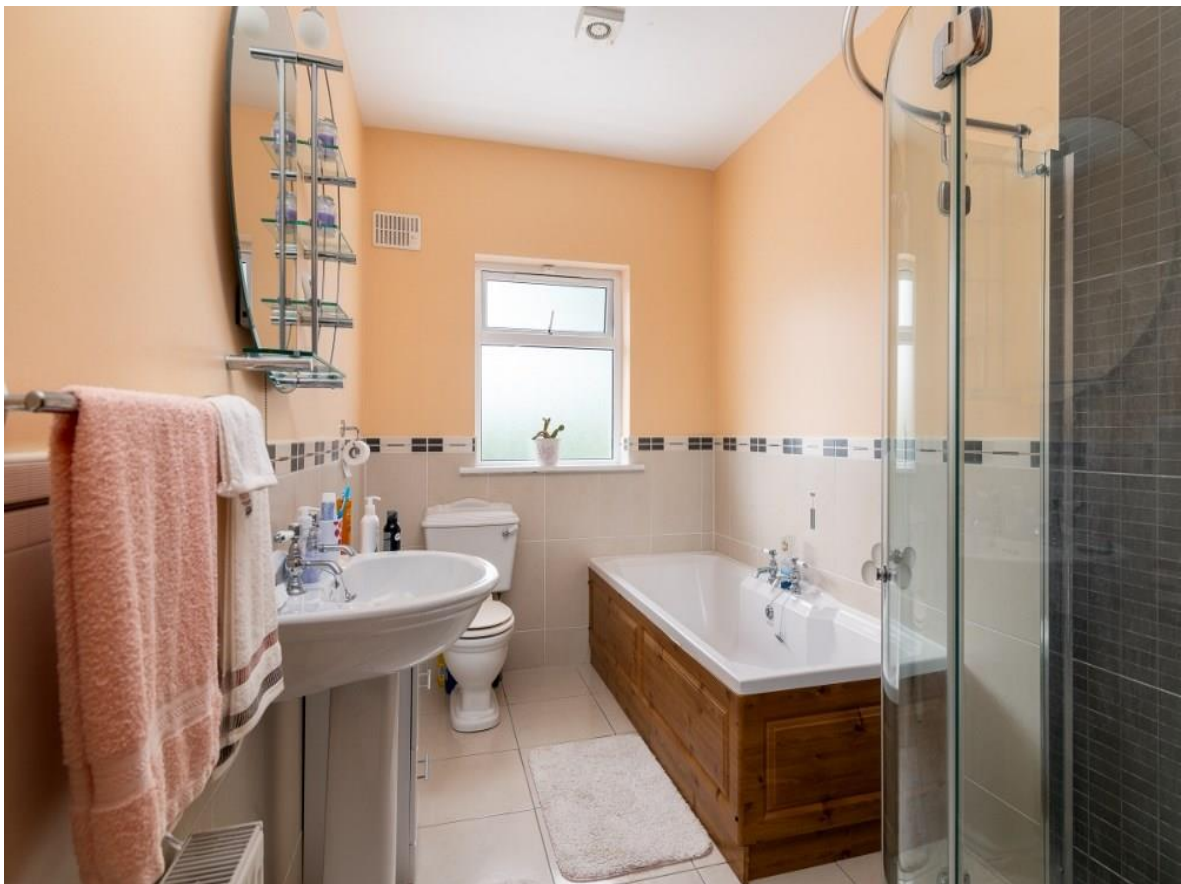
`Solas Bhríde`, Cloonsellan, Ballymurray, Co. Roscommon. F42 NX81