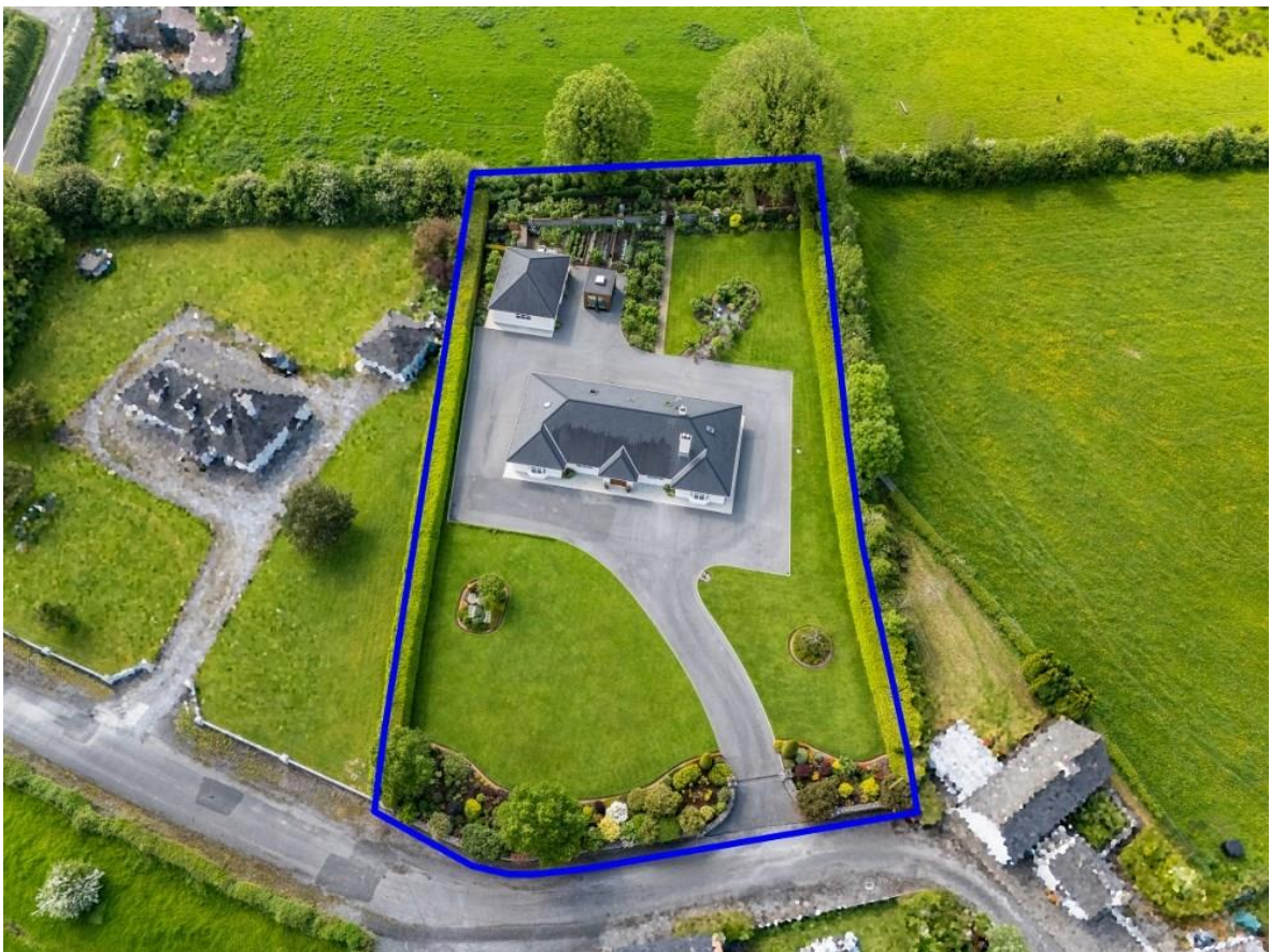
`Solas Bhríde`, Cloonsellan, Ballymurray, Co. Roscommon. F42 NX81