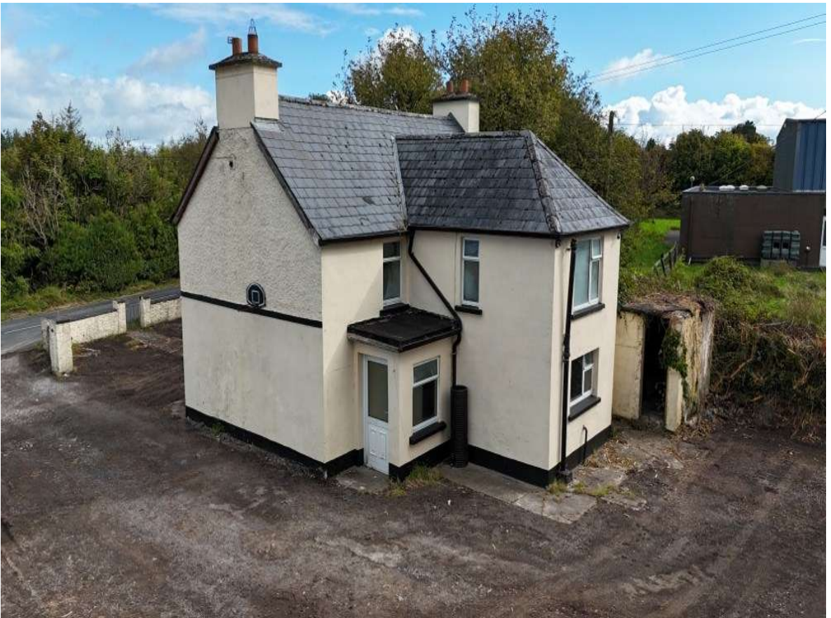
Shannagh More, Glenamaddy, Co. Galway. F45 KC61