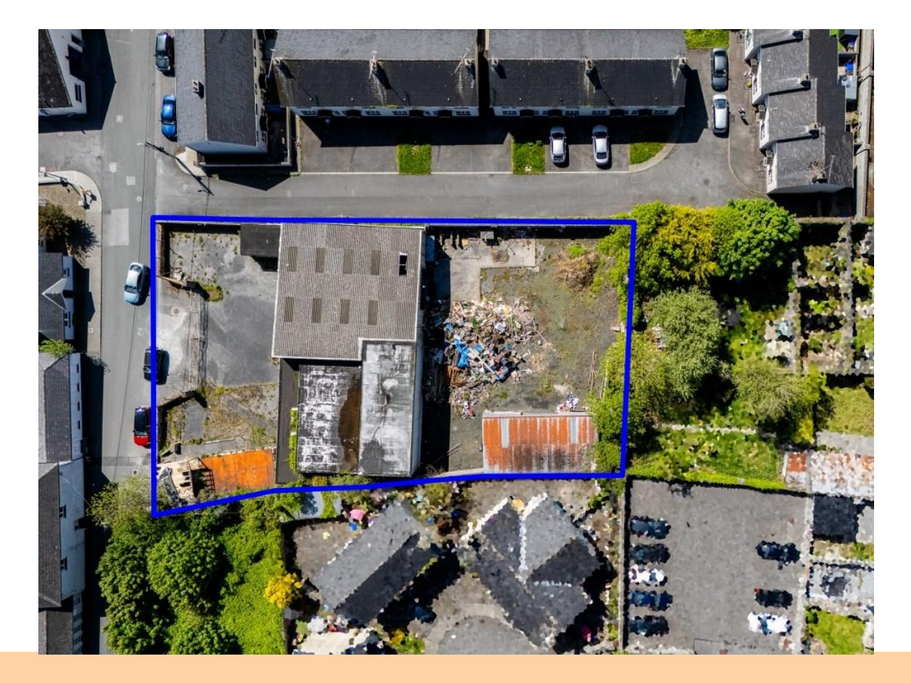
C. 0.45 Acres Zoned Lands, Henry Street, Roscommon Town, County Roscommon